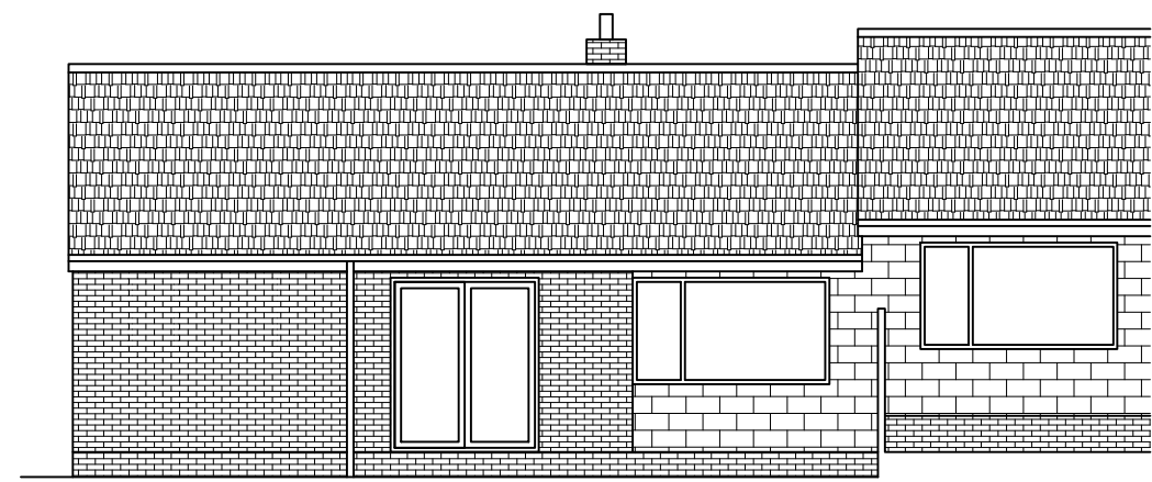
PROPOSED REAR ELEVATION SCALE 1:100 AT A3