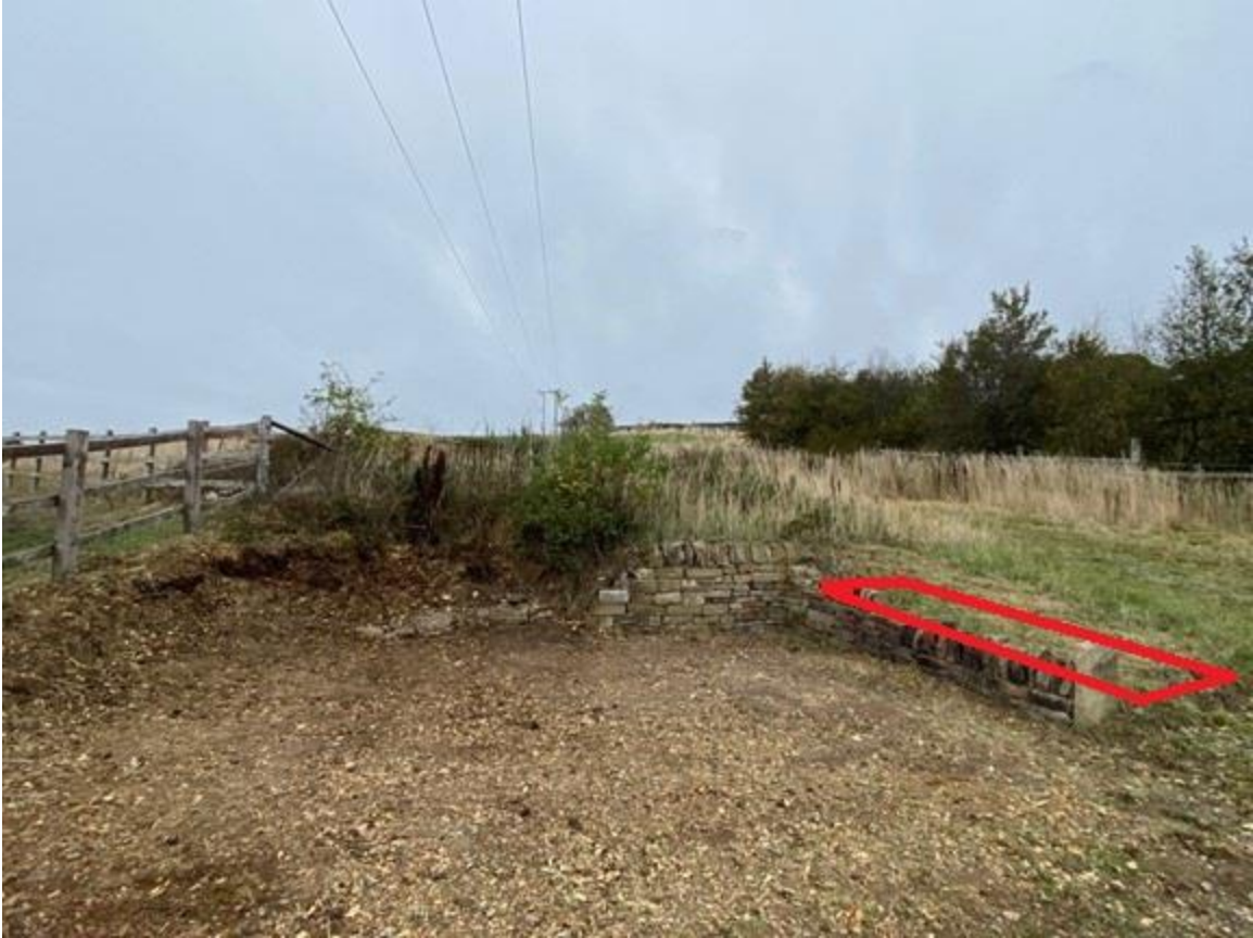
Photo: red line illustrates the 5 square metres of land for the development which is not currently hardstanding ground – this will be dug out level to the rest of the area.