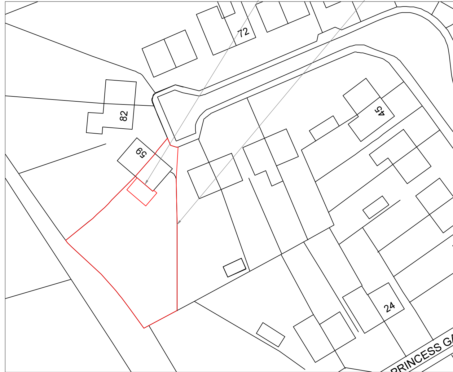
SITE PLAN SCALE 1:500 AT A3