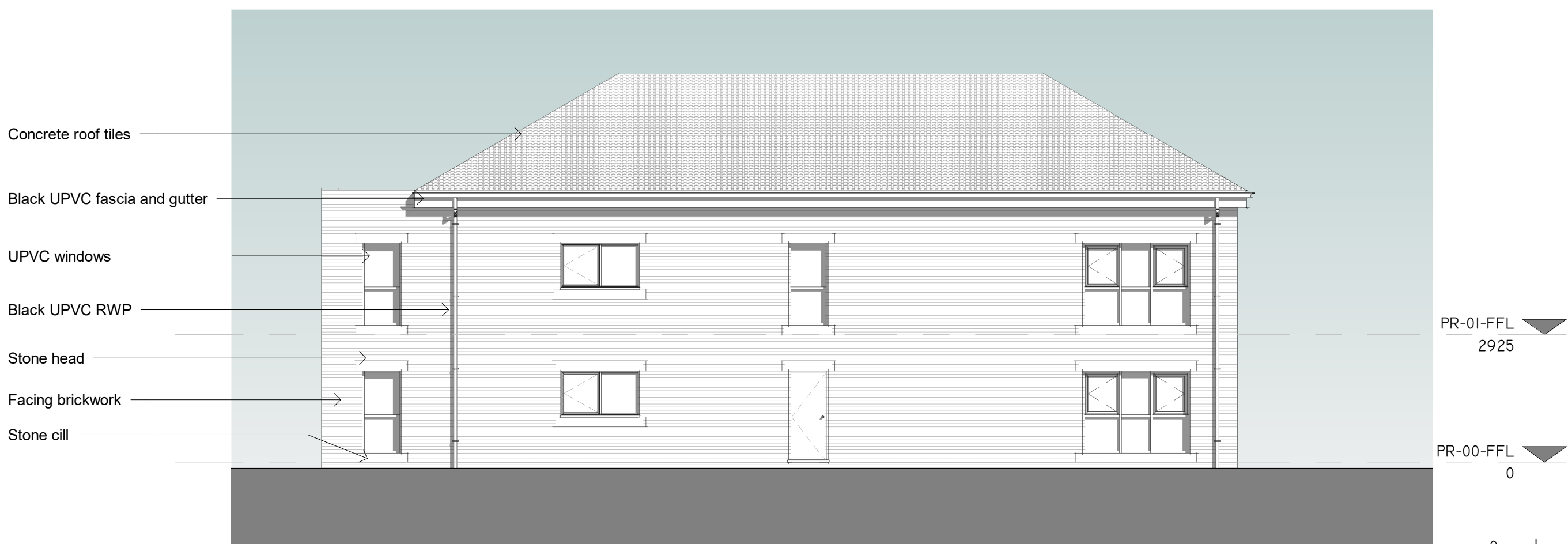
NORTH FACING ELEVATION