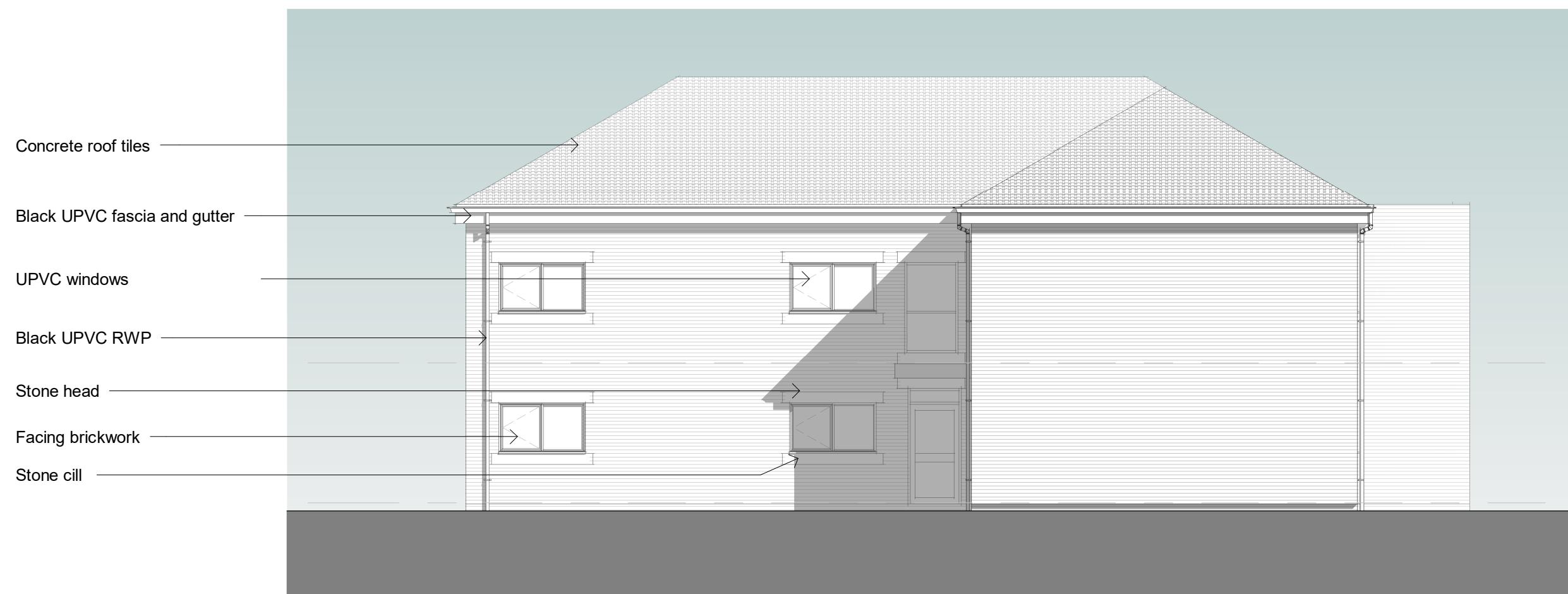
SOUTH FACING ELEVATION