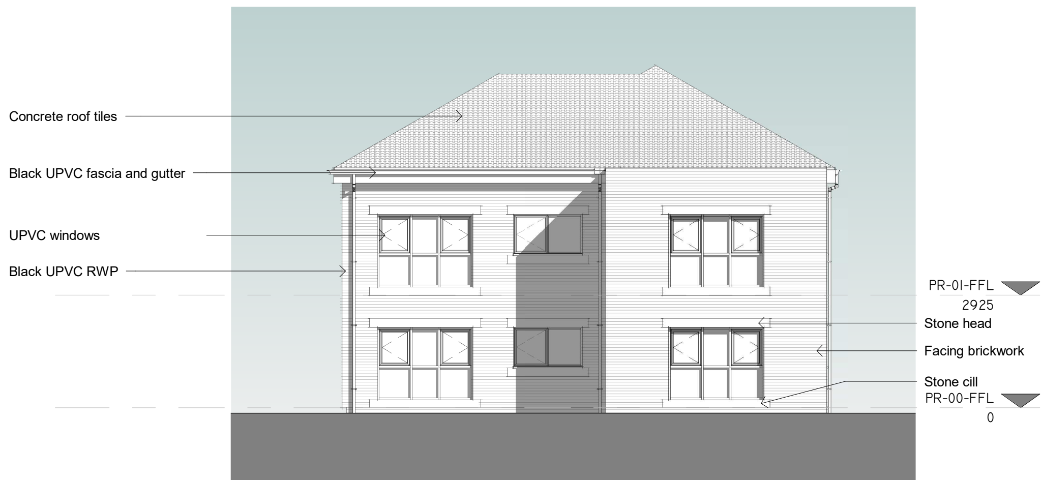
WEST FACING ELEVATION