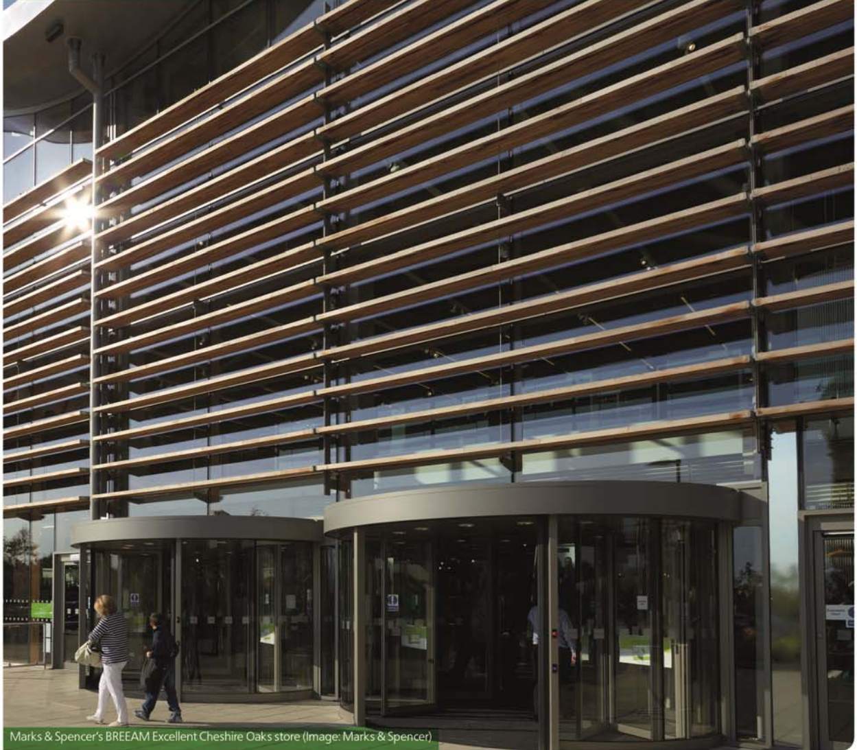
Marks & Spencer's BREEAM Excellent Cheshire Oaks store