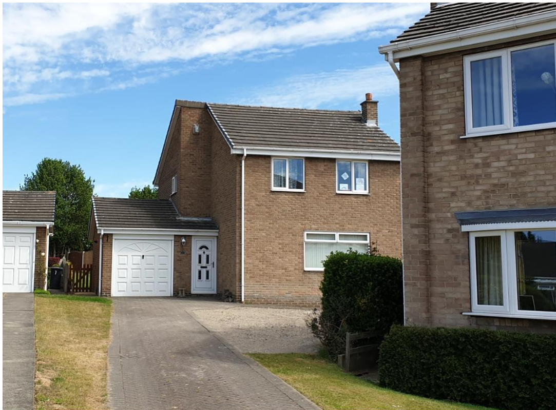
9 Haldane Close