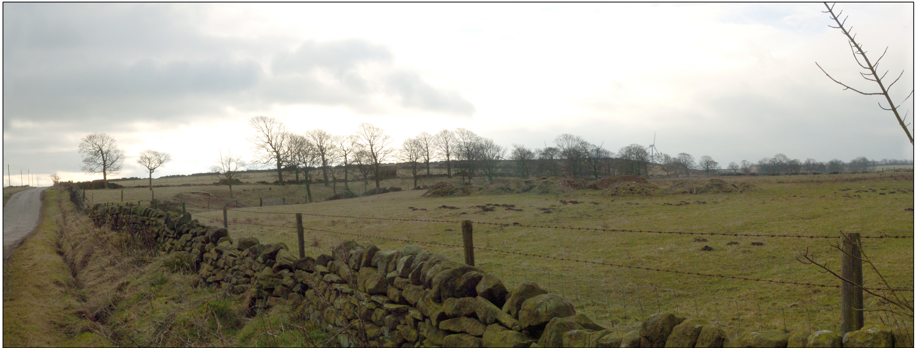
Existing view from viewpoint