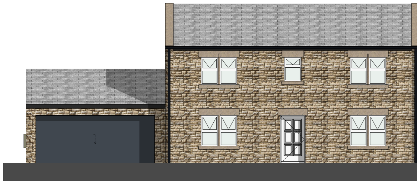
SOUTH ELEVATION - EXISTING AND PROPOSED