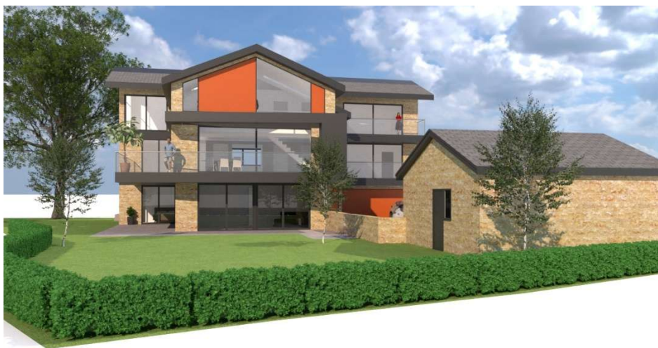
Proposal Sketch 1