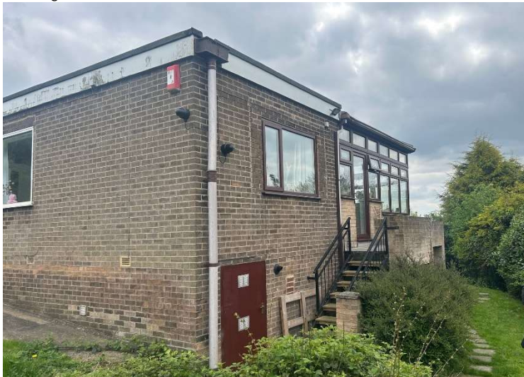
Existing Rear Garden View