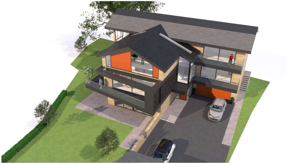
Proposal Sketch 1

The new dwelling is orientated to the south maximising the views.