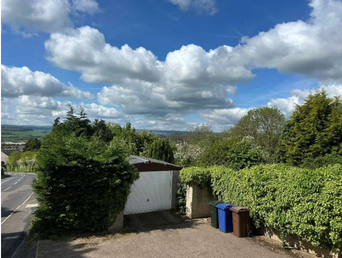
Existing Vehicular Outlook