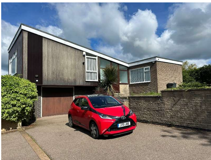
Existing Vehicular Approach View