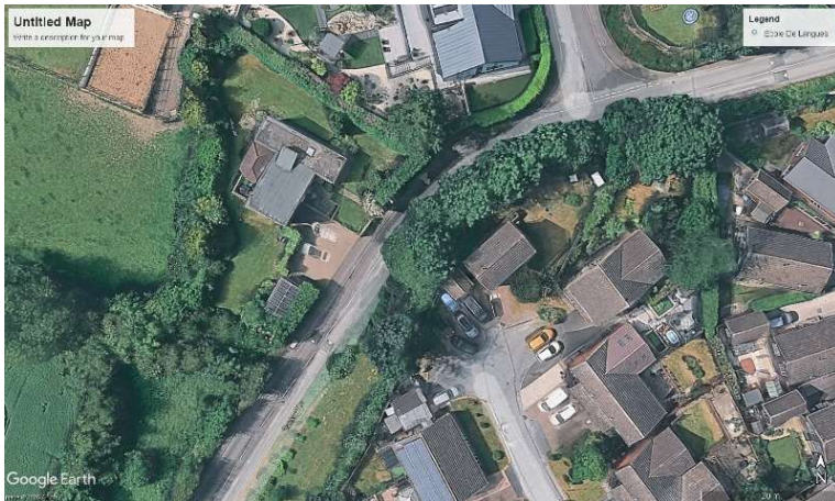
Existing Arial View