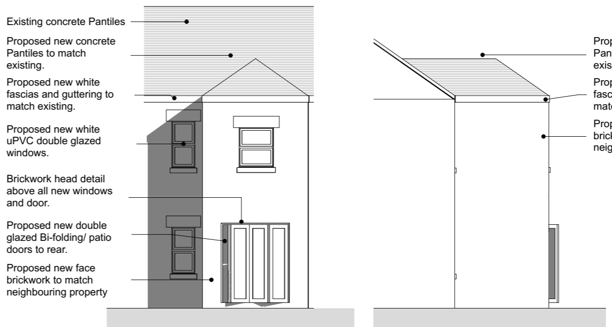
PROPOSED REAR 1:100 SIDE ELEVATION 1:100