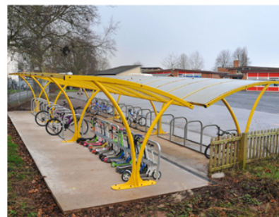
Back to Back