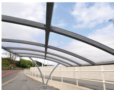
ClearView PETg UV Roof