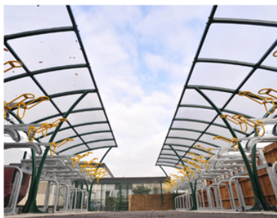
Face to Face