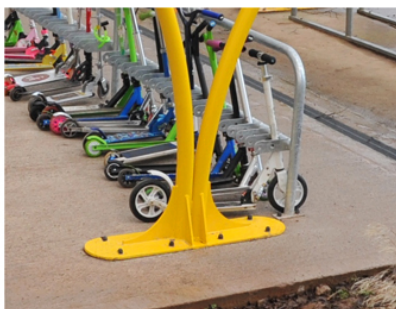
Surface Mounted Baseplates