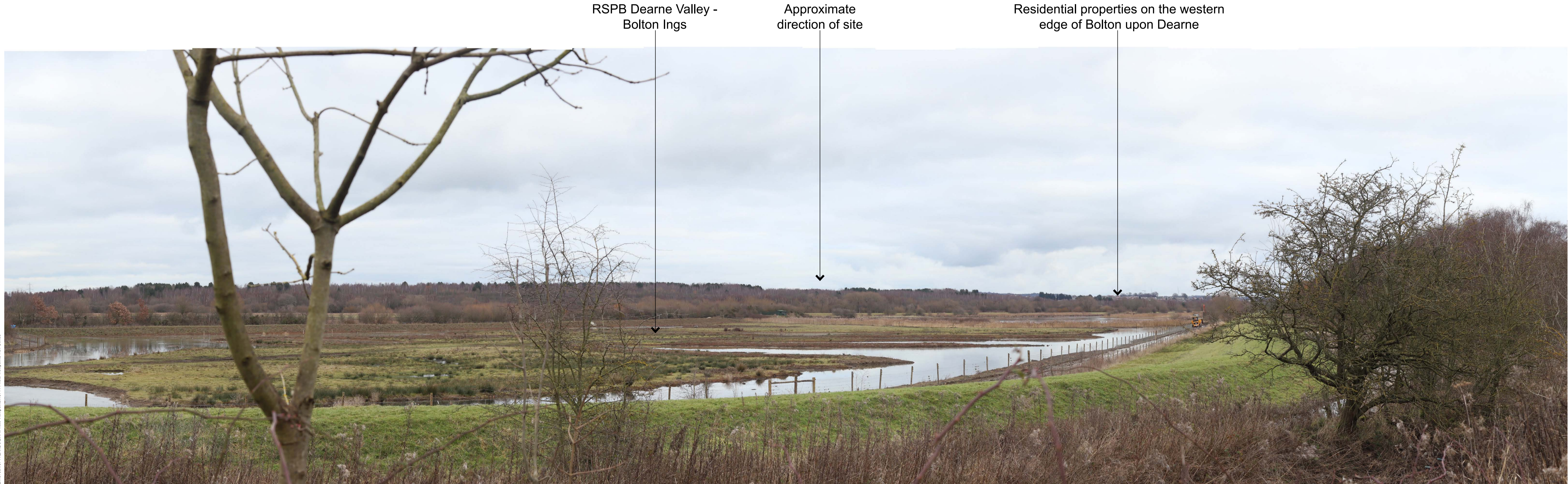
Photo Viewpoint 18: View north-east from the Trans Pennine Trail, RSPB Dearne Valley - Bolton Ings, approximately 1.8km away from the site.