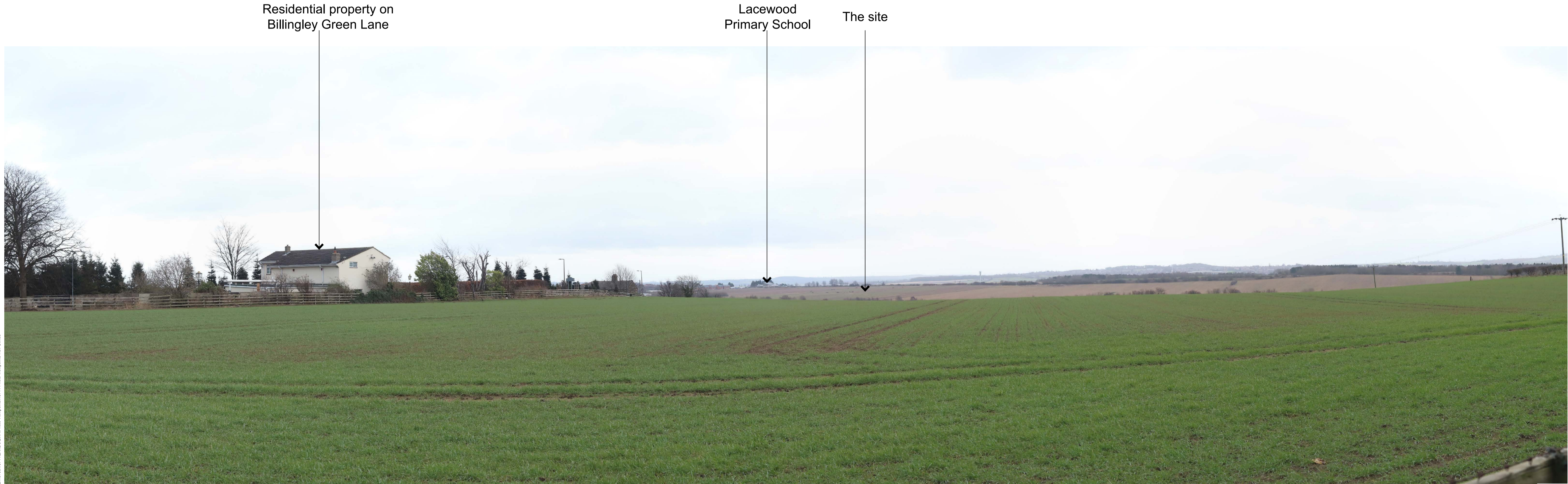
Photo Viewpoint 12: View south-east from Flat Lane, Billingley, approximately 600m away from the site.