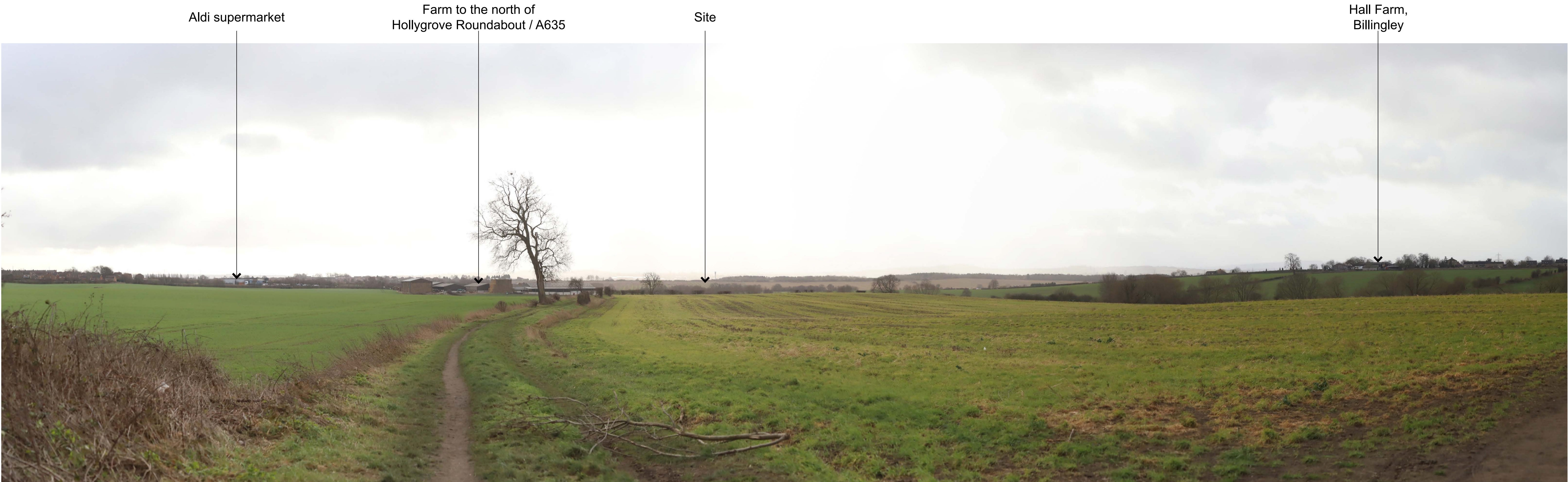
Photo Viewpoint 13: View south-west from Public Footpath 'Dearne UD 8', Thurnscoe, approximately 1.1km away from the site.