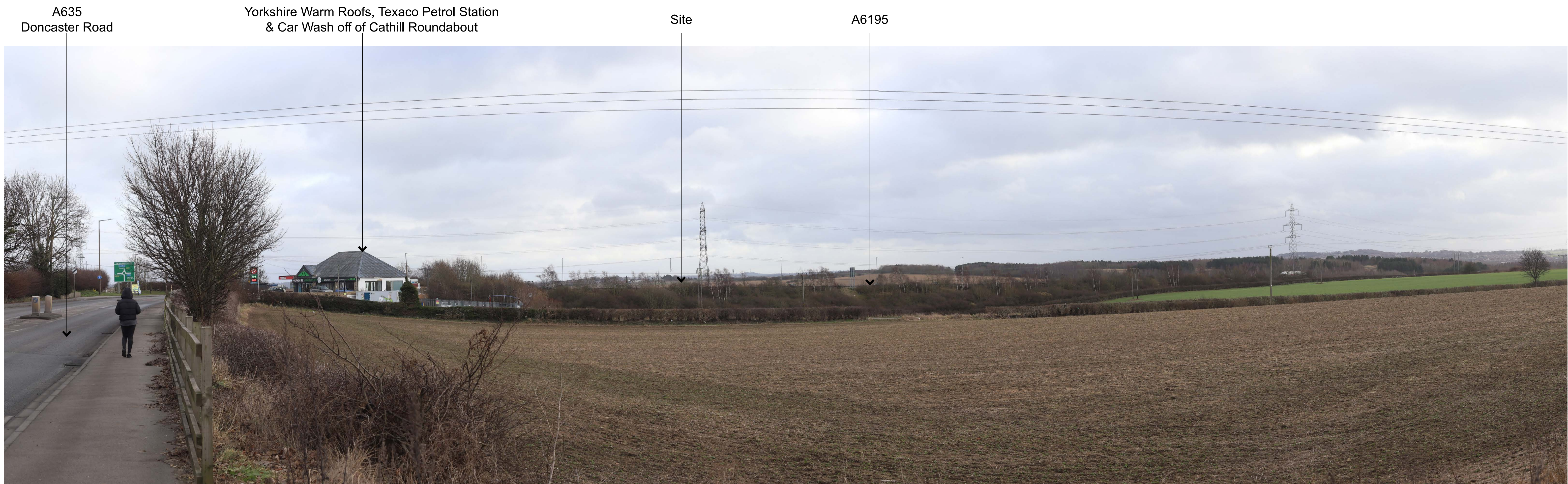
Photo Viewpoint 11: View south-east from the A635 Doncaster Road, approximately 1.4km away from the site.