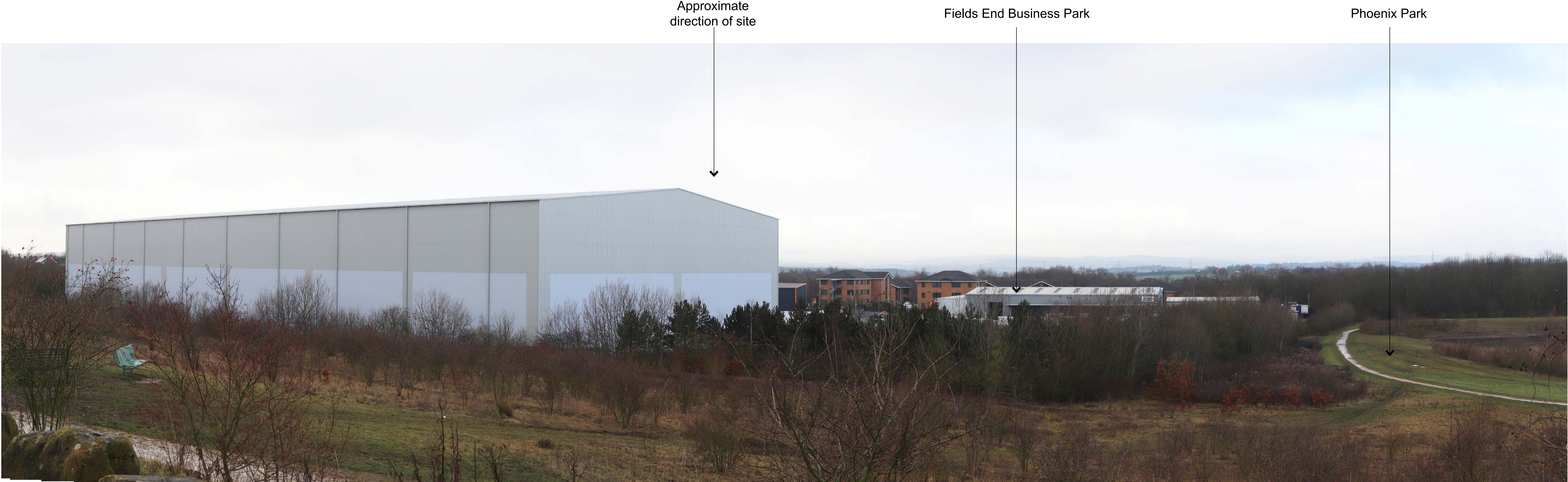
Photo Viewpoint 14: View south-west from Phoenix Park, approximately 1.7km away from the site.