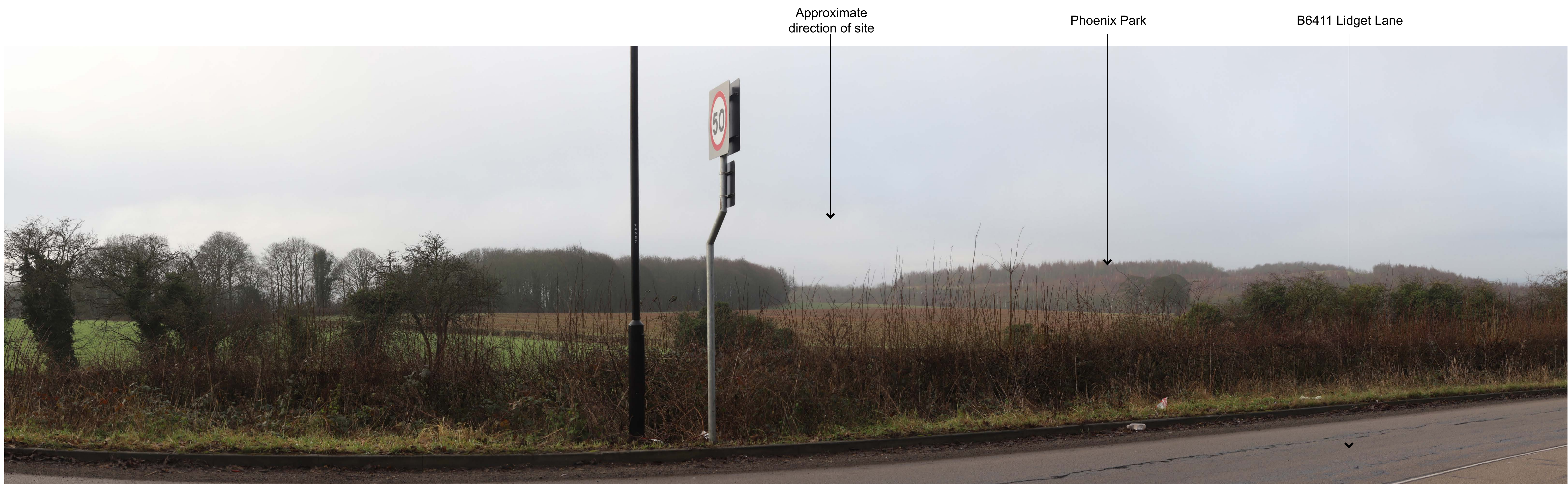
Photo Viewpoint 17: View south-west from B6411 Lidget Lane, Hickleton, approximately 3.3km away from the site.