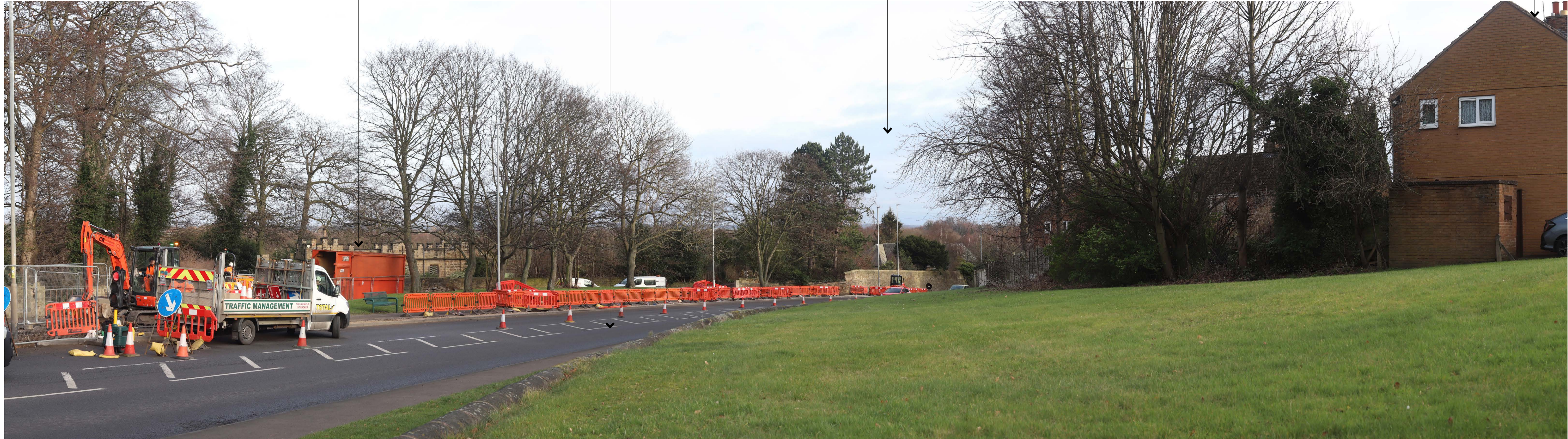
Photo Viewpoint 15: View south-east from junction of A635 Doncaster Road and Cover Drive, approximately 2.3km away from the site.