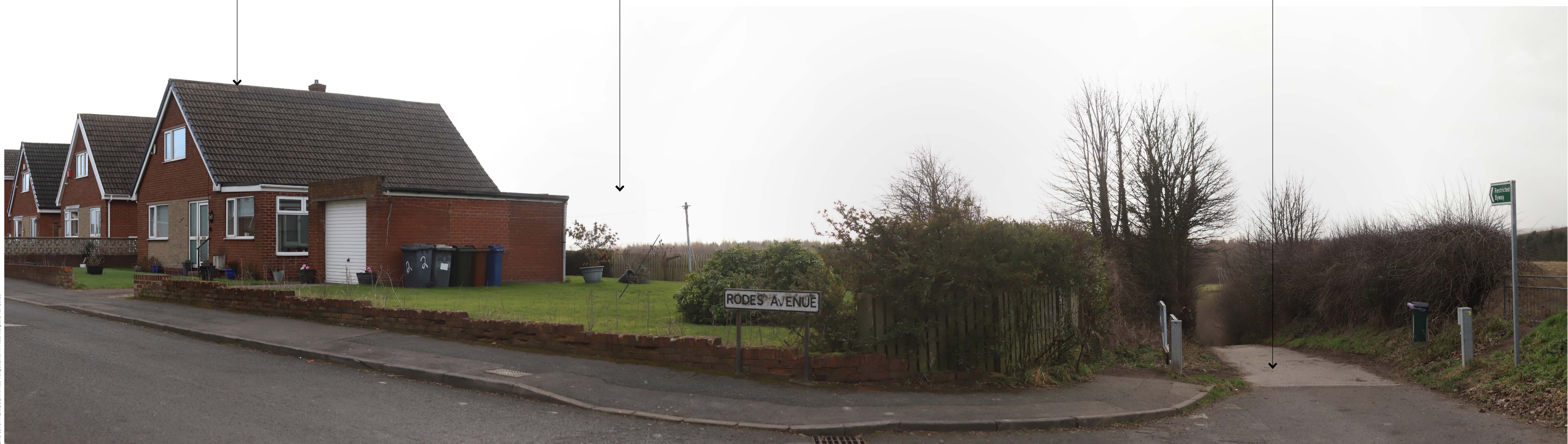
Photo Viewpoint 16: View south from junction of Rodes Avenue and Church Street, Great Houghton, approximately 2.8km away from the site.

Chapel Lane / Restricted Byway 'Great Houghton CP 10'