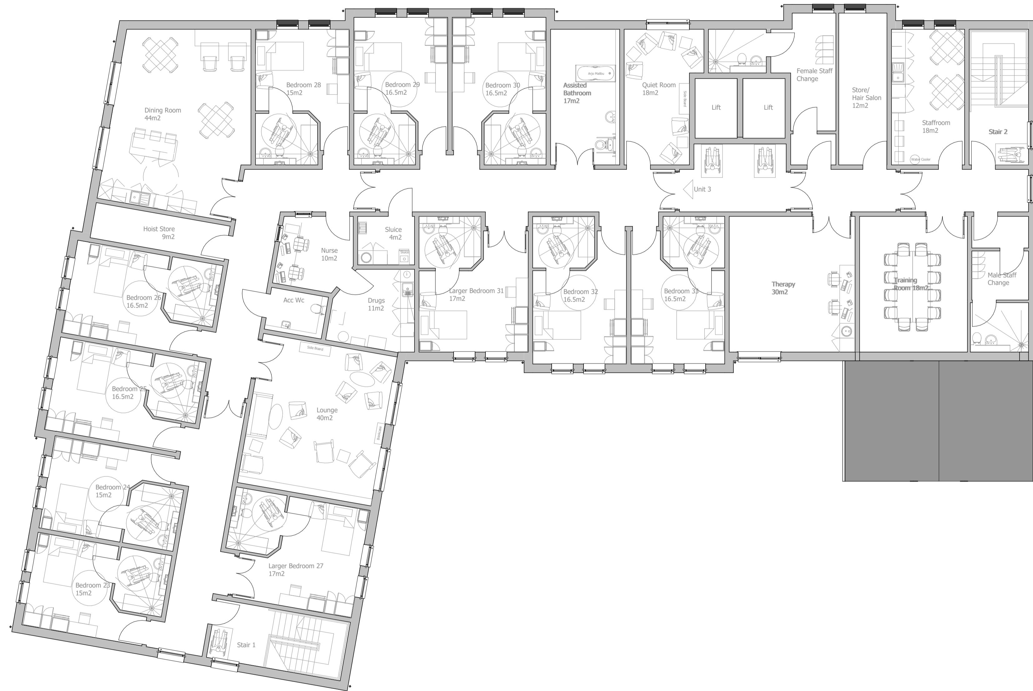
PROPOSED SECOND FLOOR PLAN 1 : 100