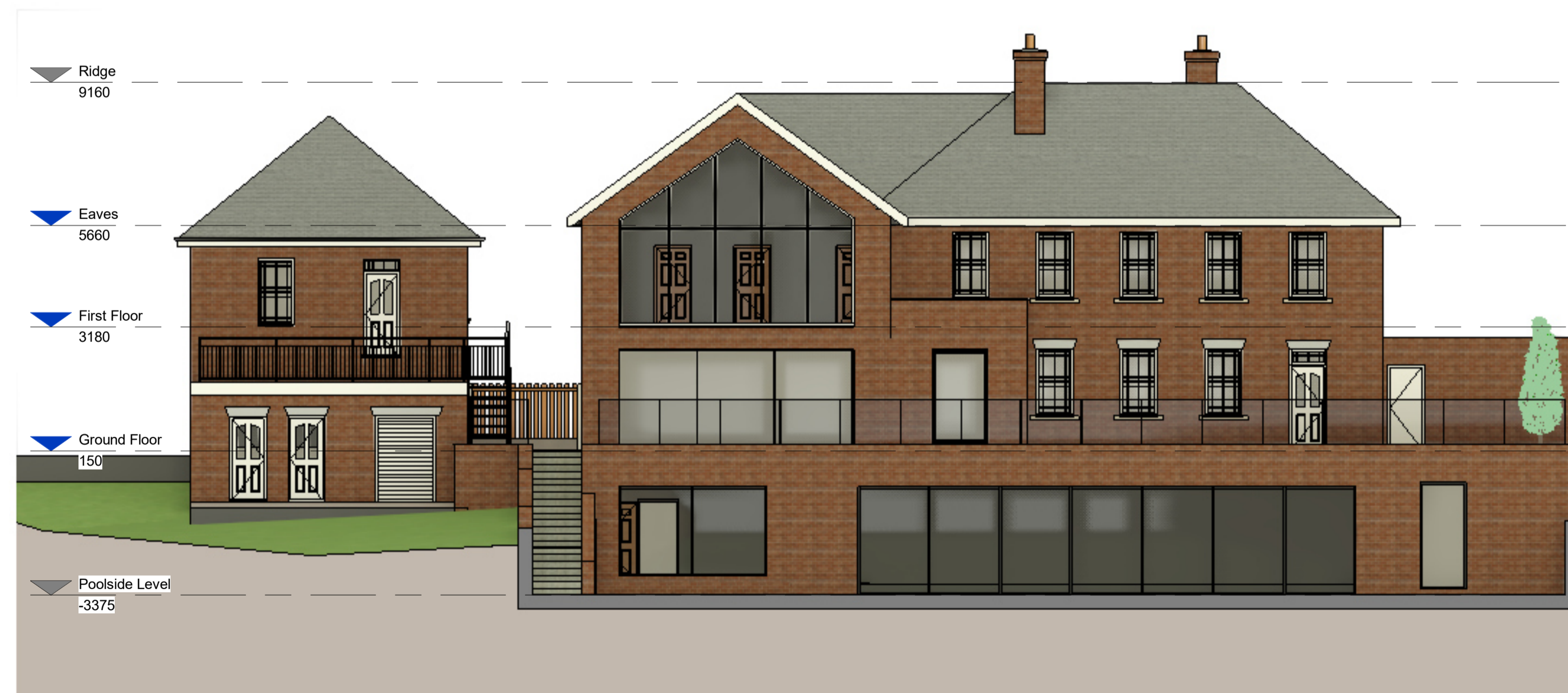
3 Proposed Rear Elevation (South West) 1 : 100