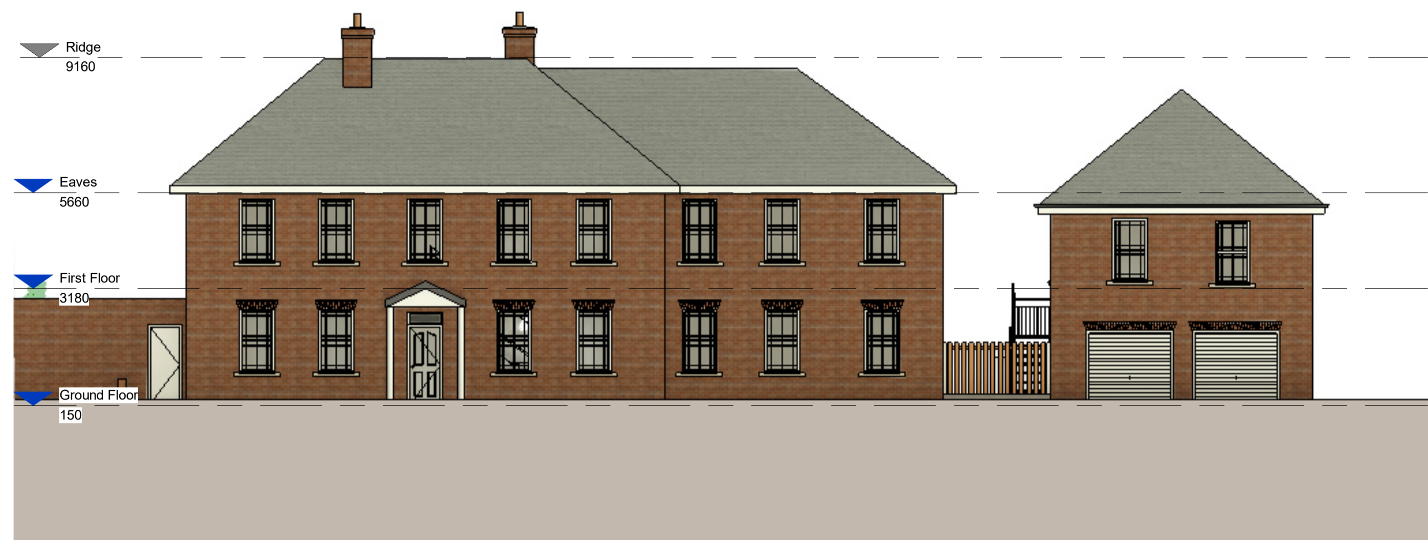
1 Proposed Front Elevation (North East) 1 : 100