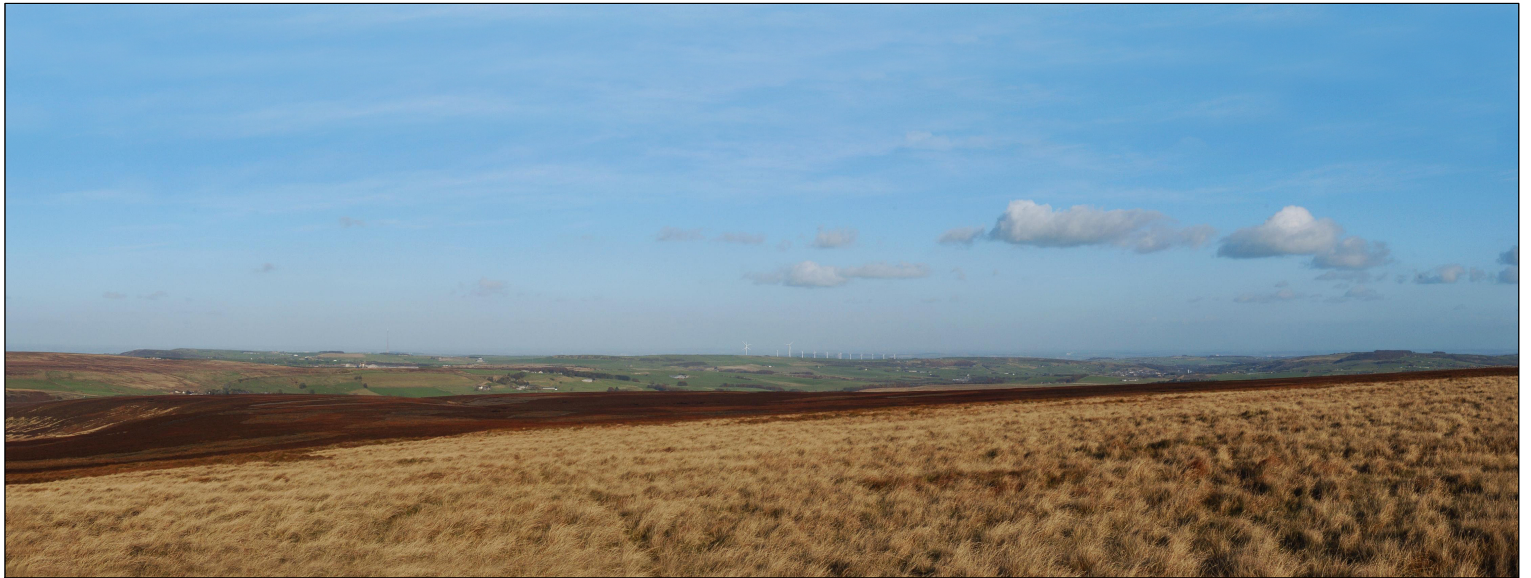
Photomontage showing proposed development from viewpoint