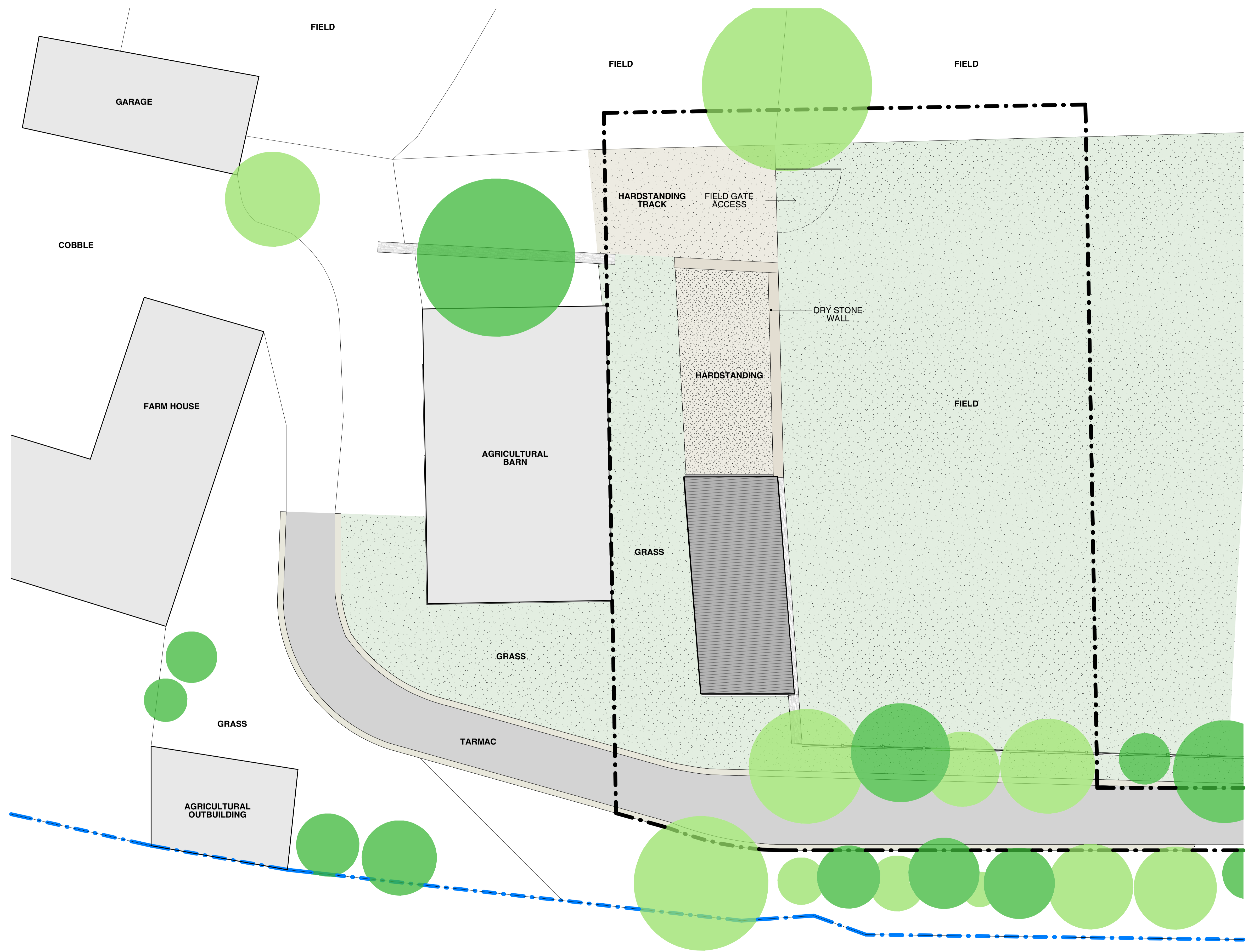
EXISTING SITE PLAN 1:100