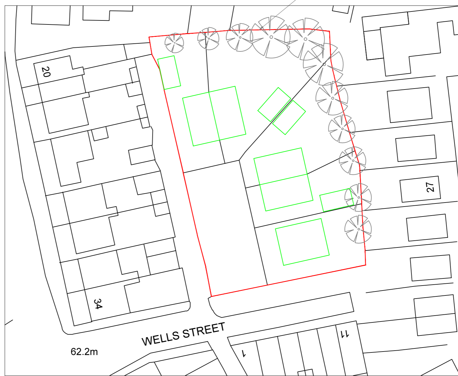
SITE PLAN SCALE 1:500 AT A3