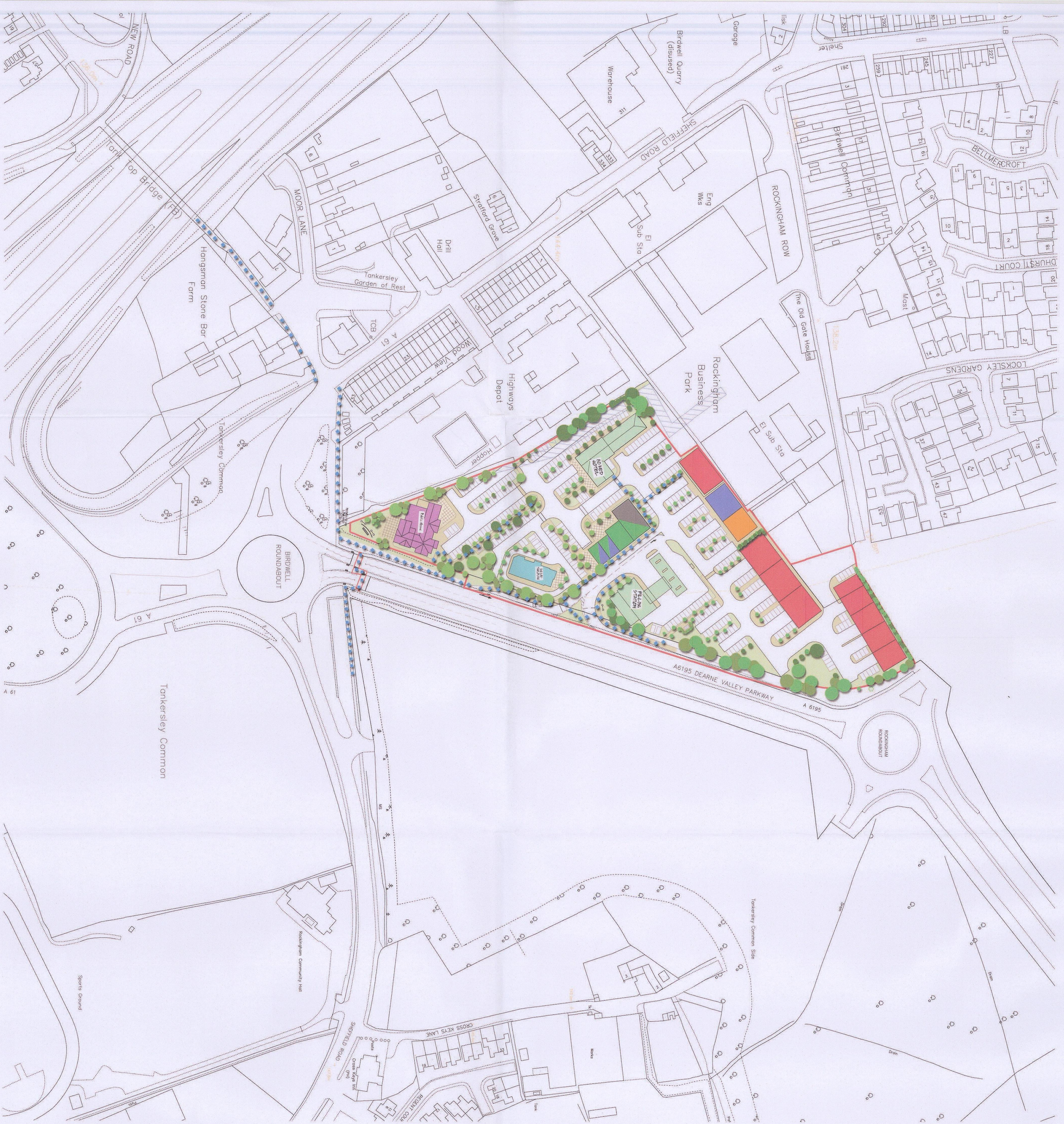
PROPOSED LAYOUT SCALE 1:1250