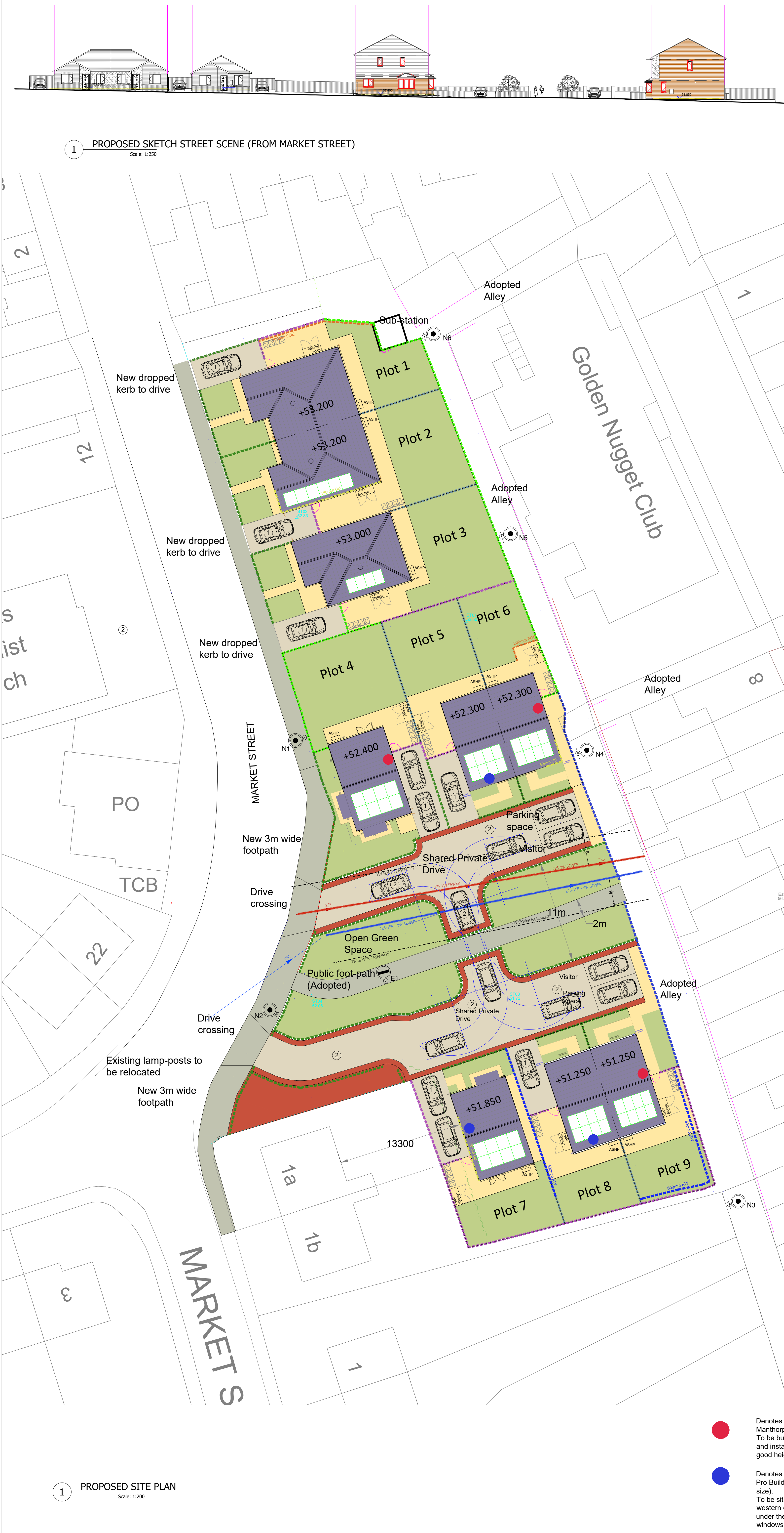
1 PROPOSED SKETCH STREET SCENE (FROM MARKET STREET) Scale: 1:250