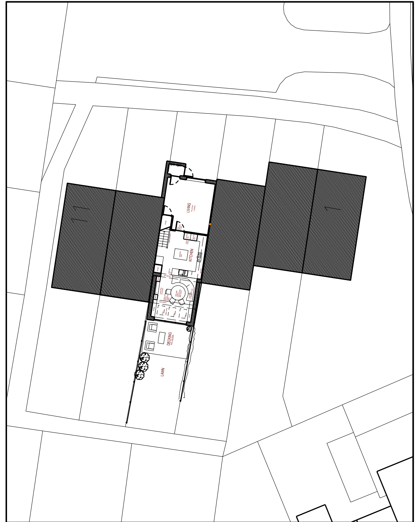
Site Plan - Proposed