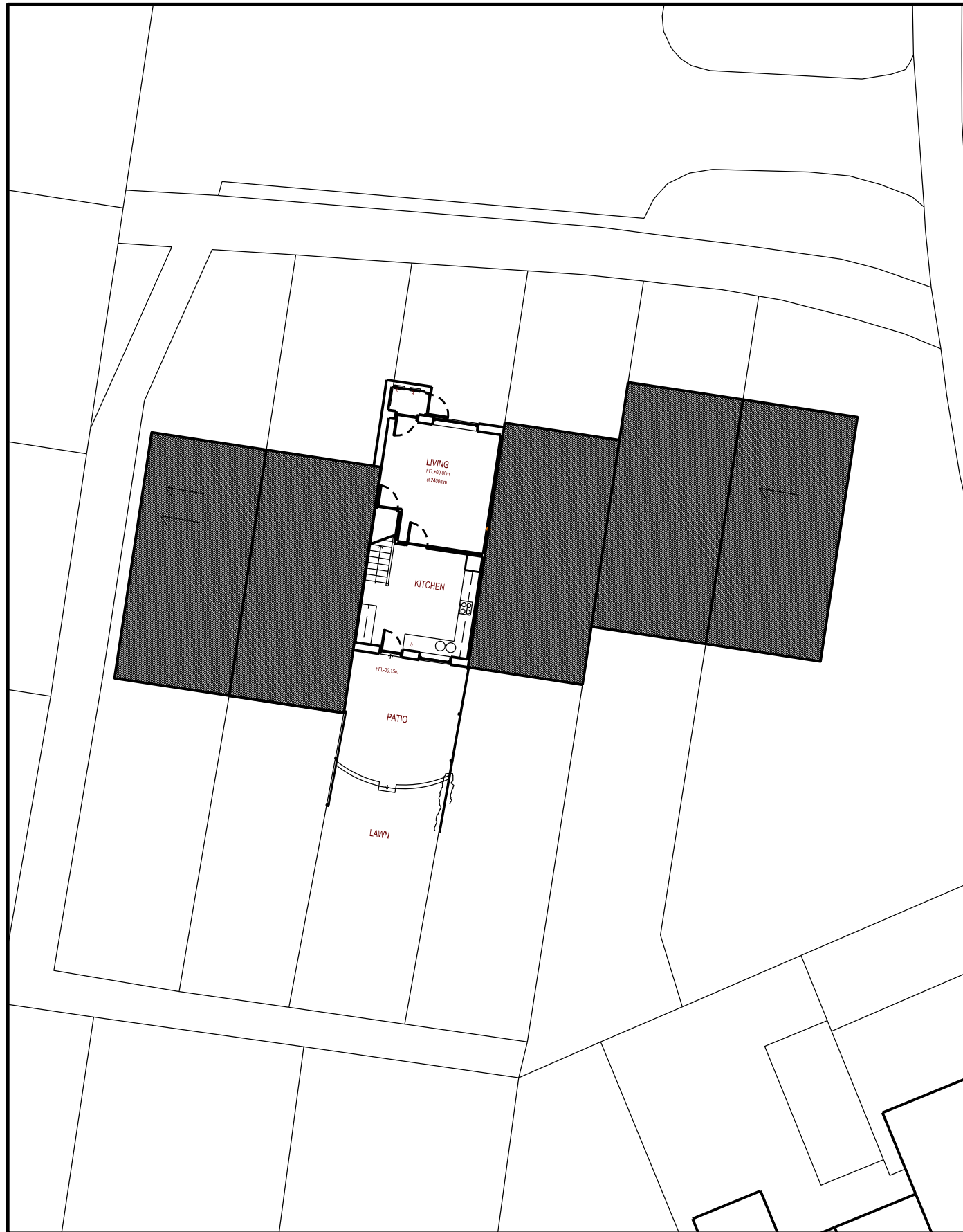
Site Plan - Existing