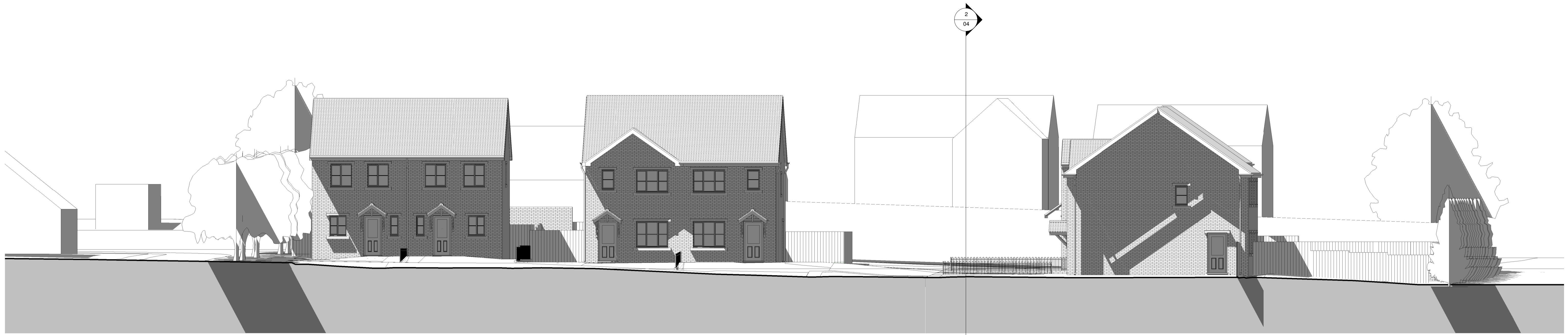
Section - A North South Looking West - As Proposed 1 : 100