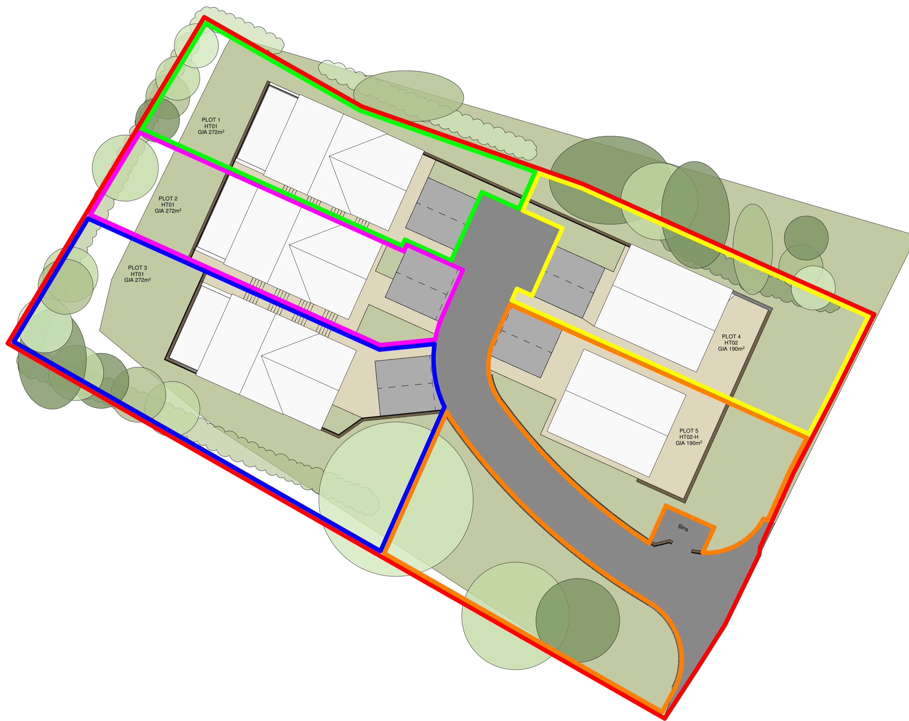
Proposed Site Plan Scale: 1 : 200