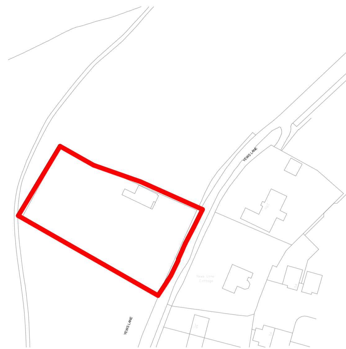
Location Plan Scale: 1 : 1000