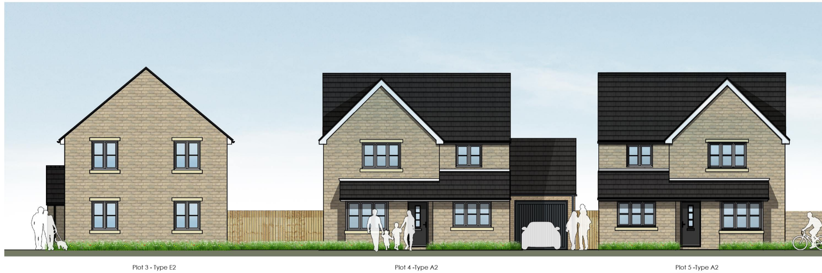
STREET SCENE A-A @ 1:100