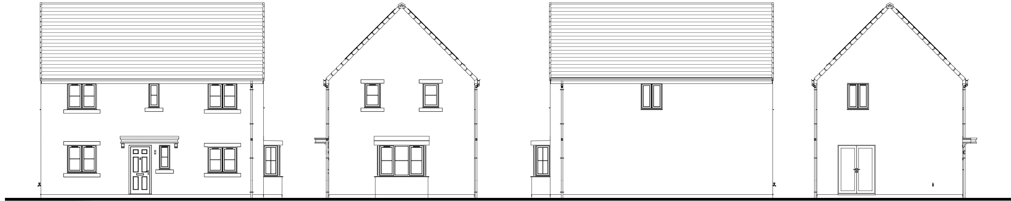
FRONT ELEVATION 1