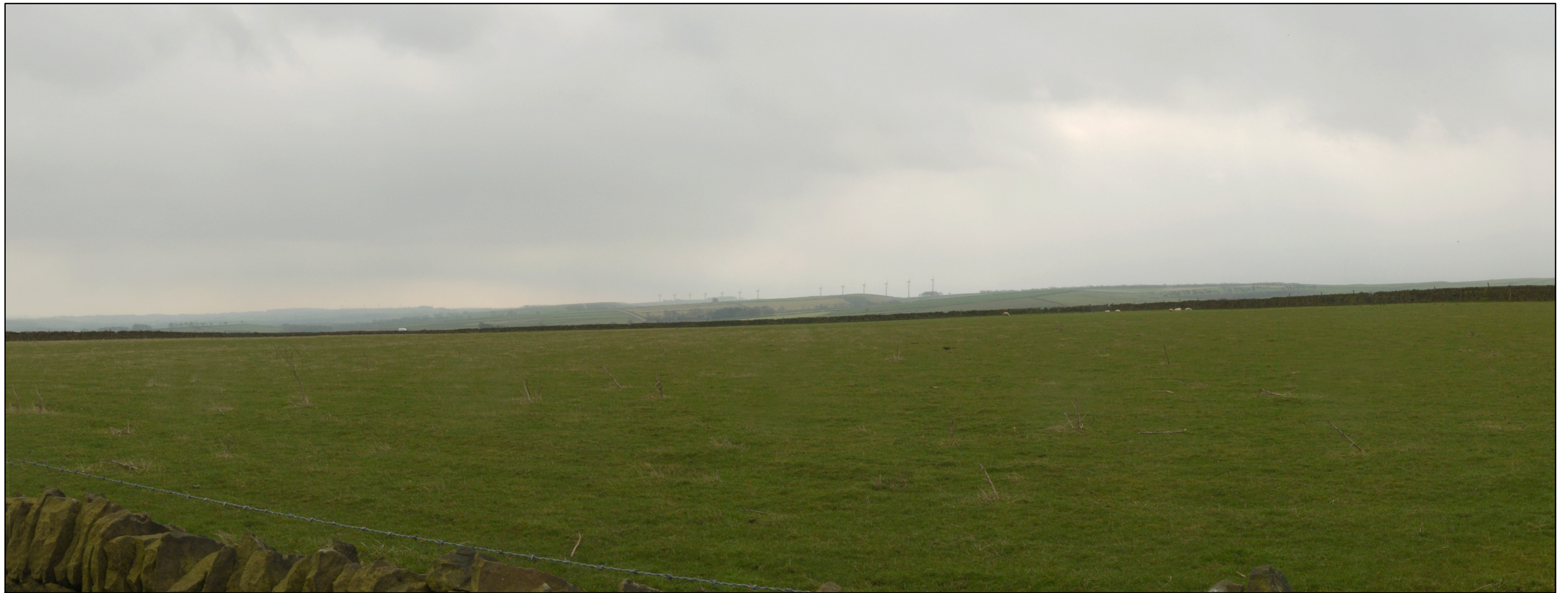
Existing view from viewpoint