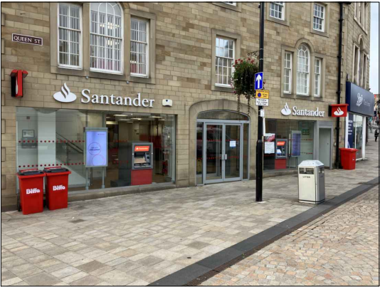
EXISTING ELEVATION PICTURE

Notes. This Drawing is the copyright and property of Santander UK PLC. It must not be copied or published without written consent.