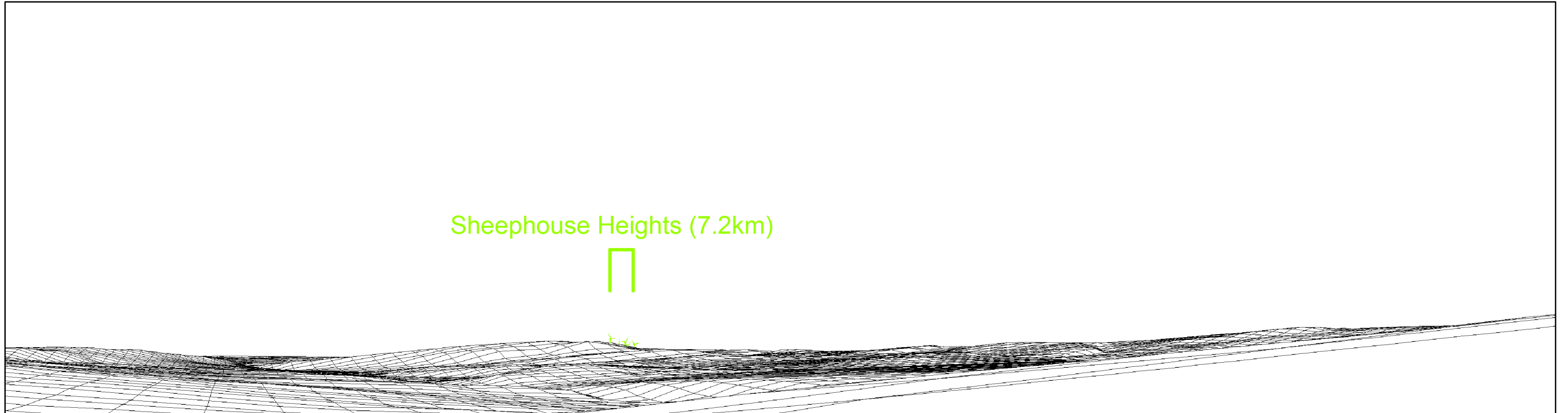
Computer generated wireline of proposed development