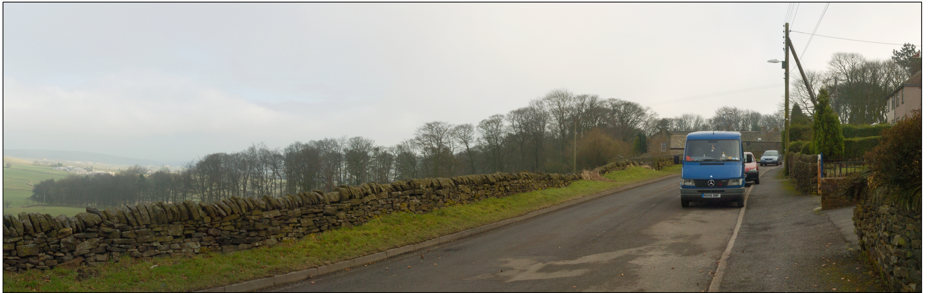
Existing view from viewpoint