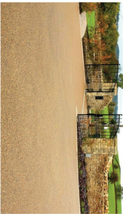
Indicative image of resin bonded gravel driveway