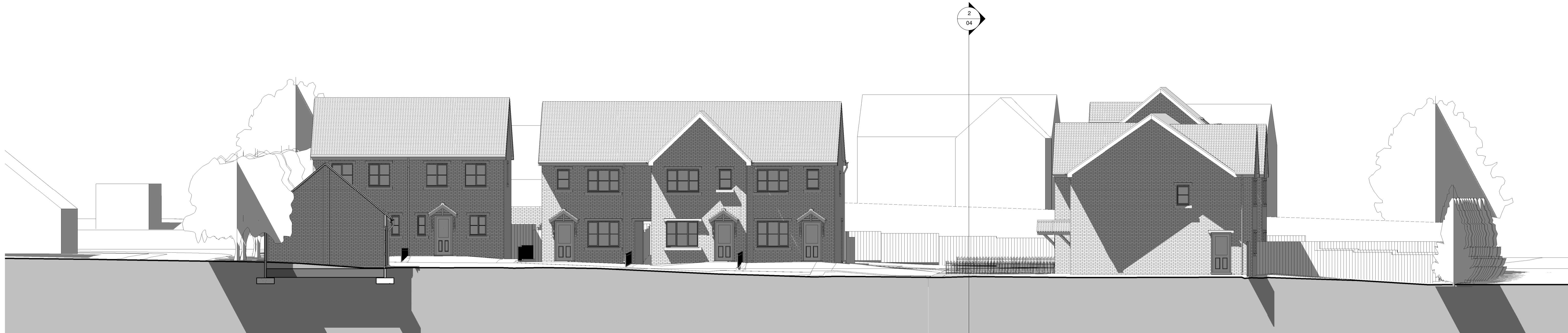
Section - A North South Looking West - As Proposed 1 : 100