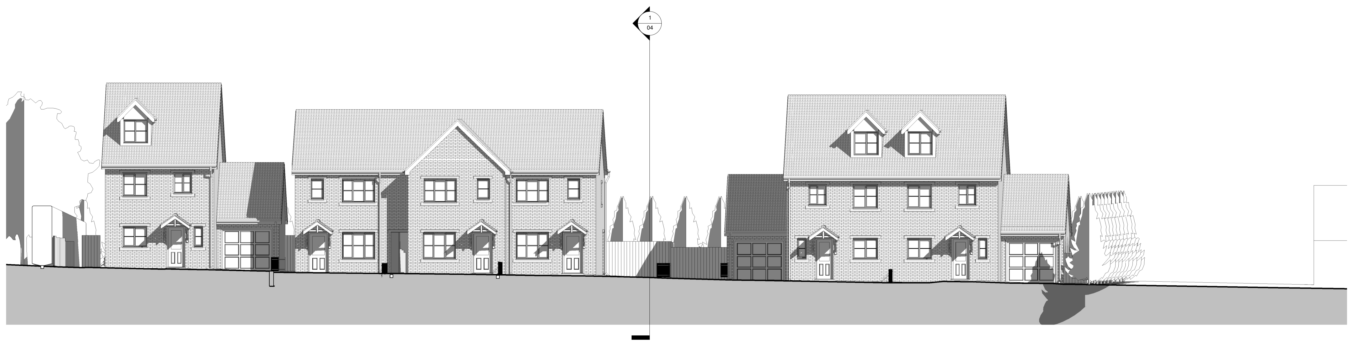
Section - B. East West Looking North - As Proposed 1 : 100