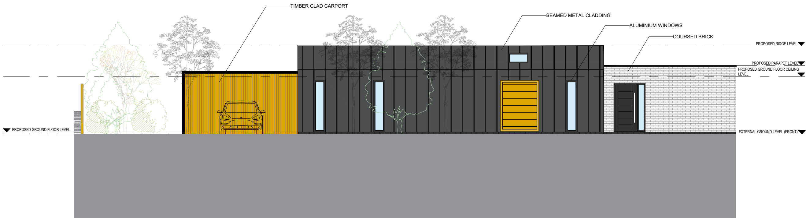
Proposed Front Elevation 1 : 100