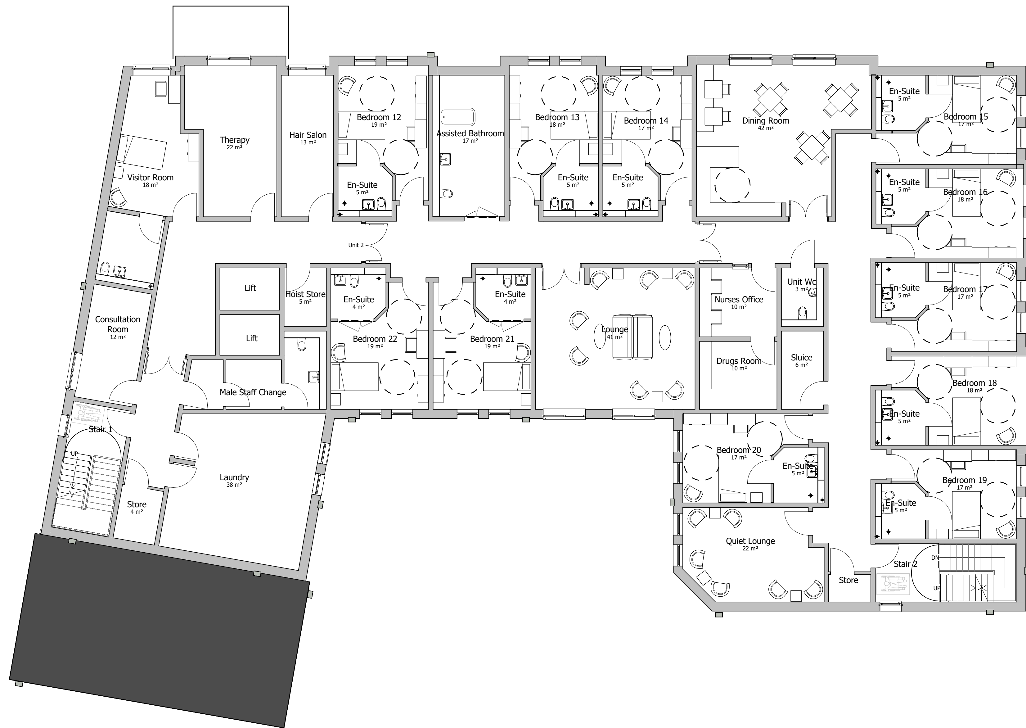
2 | First Floor Plan 1 : 100

C1 25.01.24 GB NM Revised Following Client Comments