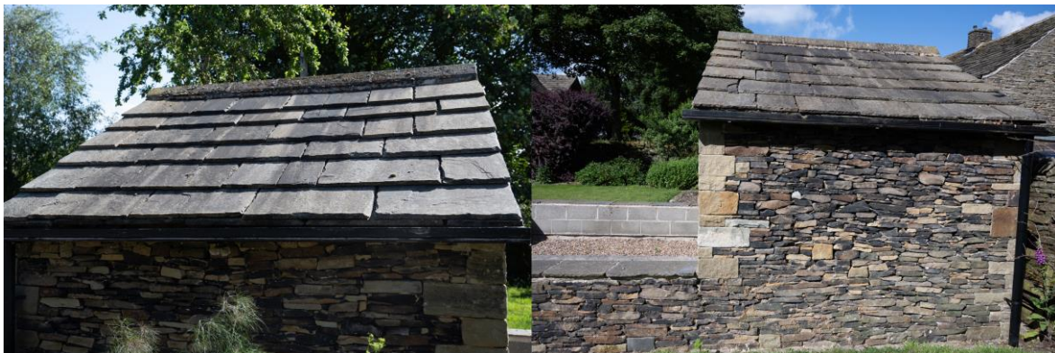
Photo1 showing the roof exterior.

The site comprises a large garden with a lawned central section and ornamental planting to borders along the edges of the site. There is a stone garden shed located on the north edge of the site that has only been constructed recently and is a low, single storey building. The roof is covered with large stone tiles over a breathable membrane, and it exhibits the usual natural gaps associated with this style of roof. There are no obvious signs of bats and given it's low height combined with the fact that it is surrounded by much larger, period buildings all offering greater roosting potential, experience suggests that it is unlikely that bats would use this roof.