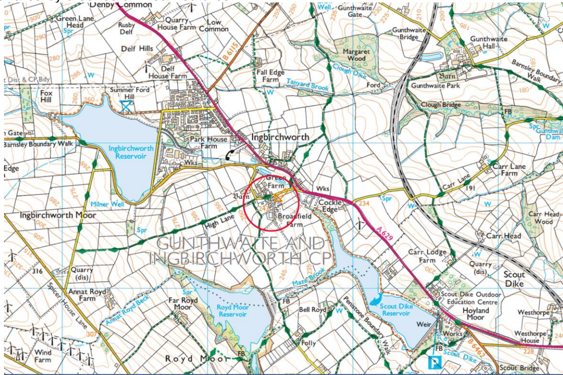
Figure 1. Site location plan

5.1 The site consists of a large garden in a rural setting just off High Lane, Ingbirchworth and is surrounded by many other period buildings all of which offer greater roosting potential. The habitat around the site is average quality in terms of foraging but the site is connected to the wider area by a series of linear features.