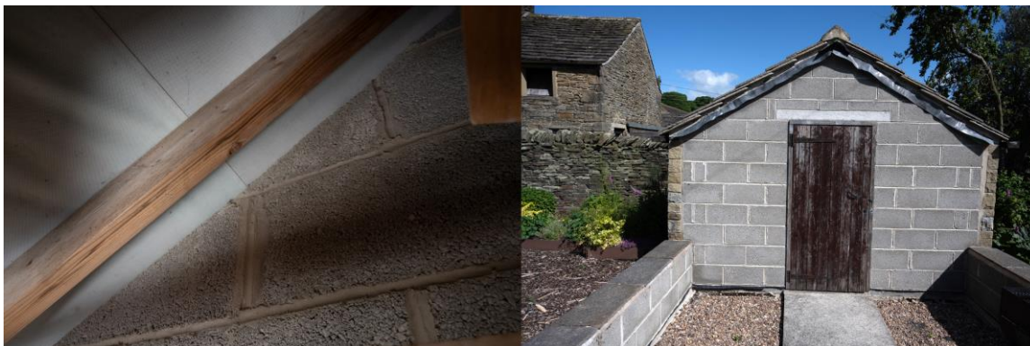
Photo 2 showing internal and external gable

The garden is mostly lawned edged with ornamental plantings comprising low shrubs such as berberis, forsythia, elder and laurel interspersed with verberna, foxgloves, euphorbia etc. None of the vegetation within the grounds offer any potential bat roosting features but may provide foraging for bats passing through the area as they emerge from nearby buildings. A check was made for nesting birds, but no active nests were noted. Nesting birds should be considered before ground clearance takes place with clearance works be undertaken outside the bird nesting season (Feb-July inclusive).