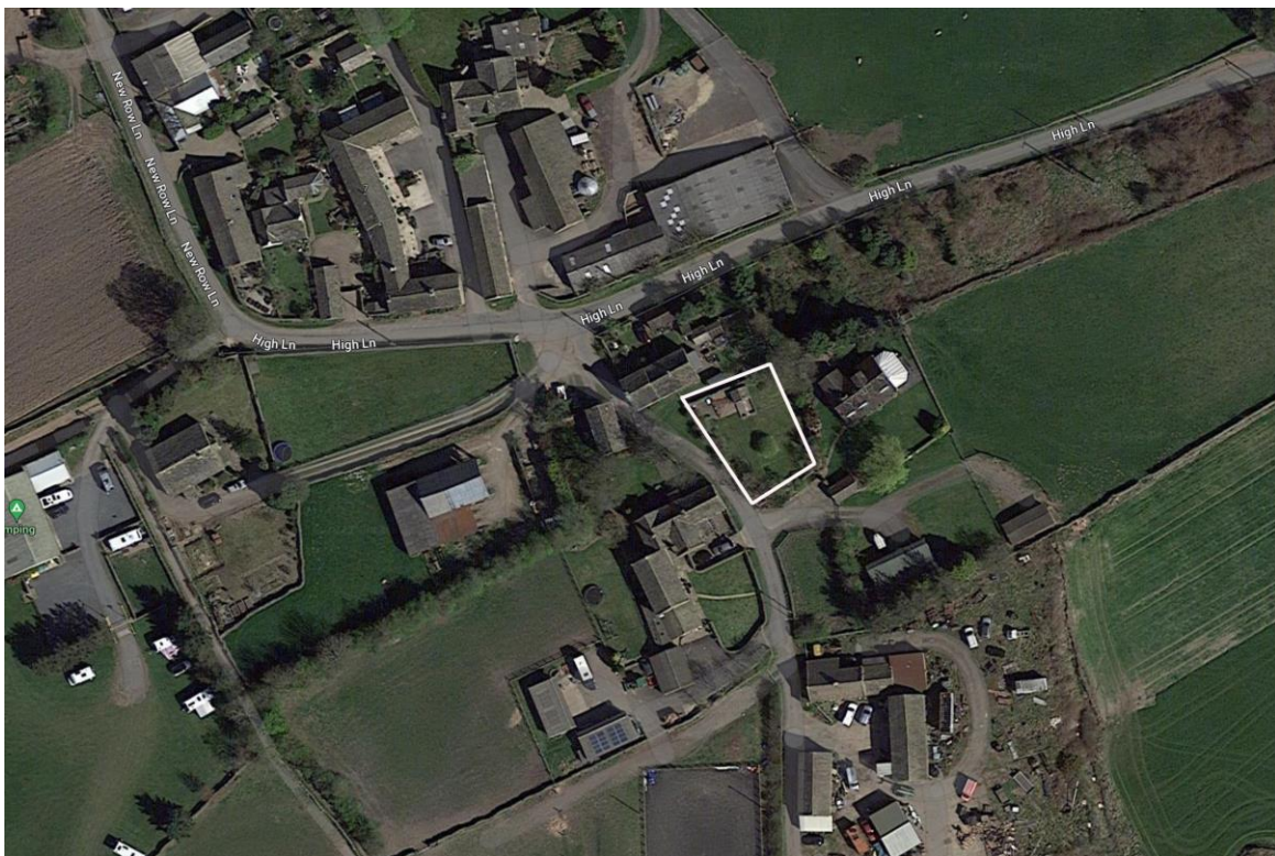
Figure 2 Aerial view of the site, surrounds and specific buildings surveyed.