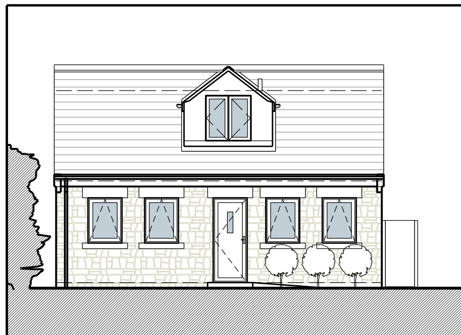
South Elevation - Proposed No1,2,3,4