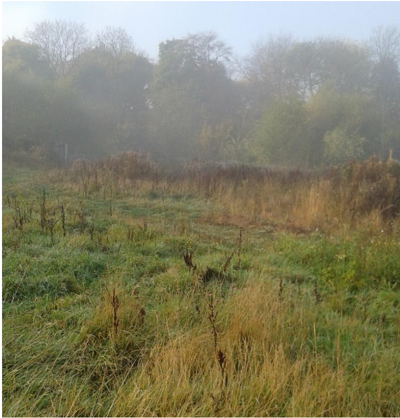
PND4.01 Semi-improved grassland and tall ruderals