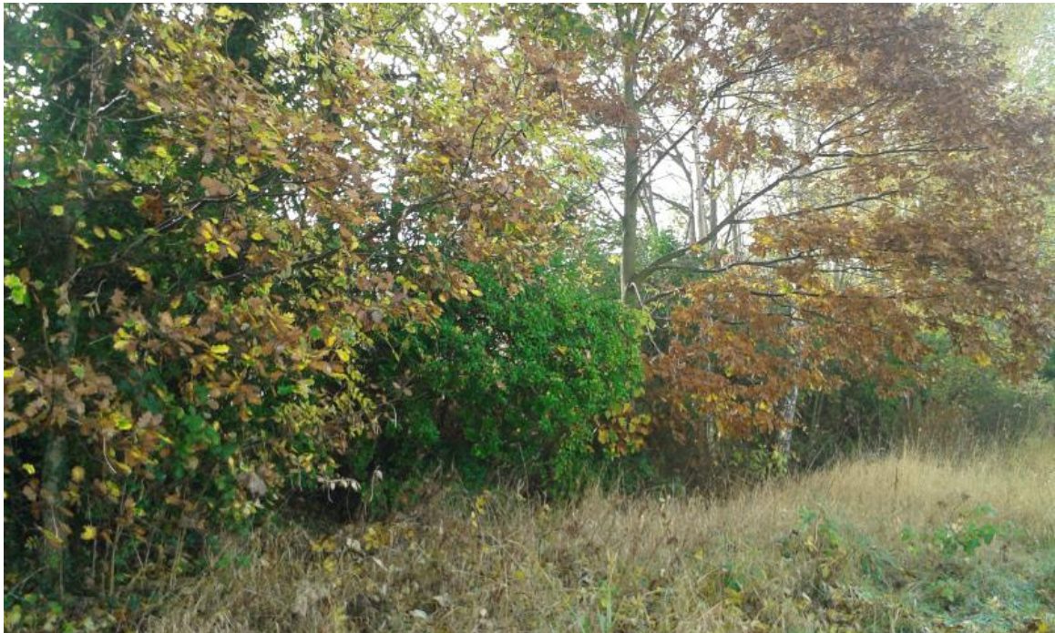
PND4.02 Strip of trees