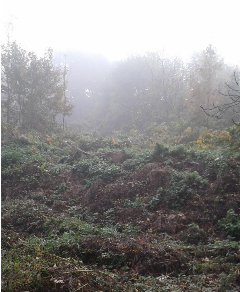
PND4.03 Scrub and tall ruderals