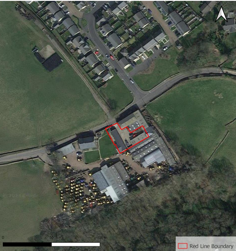
Figure 1 The surveyed building - red line