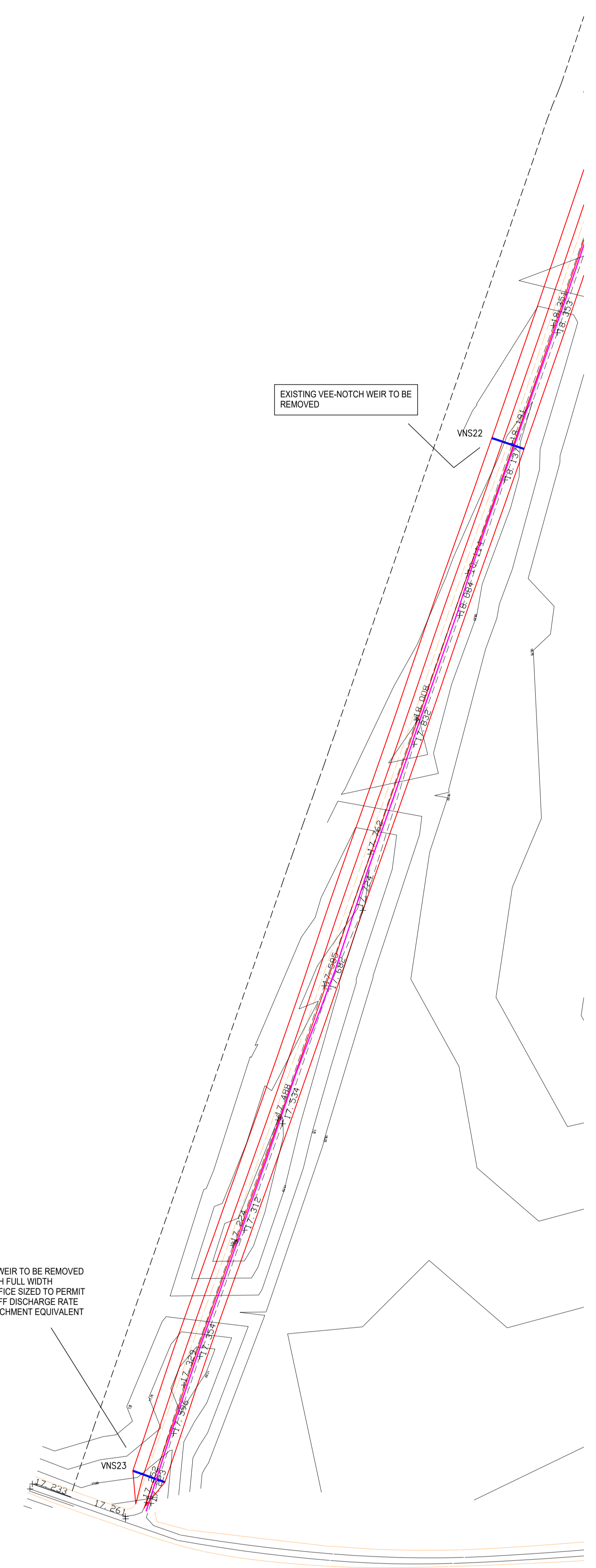
OUTFALL INTO EXISTING RIPERIAN WATERCOURSE

SEE ADJACENT FOR OUTFALL INTO IDB WATERCOURSE