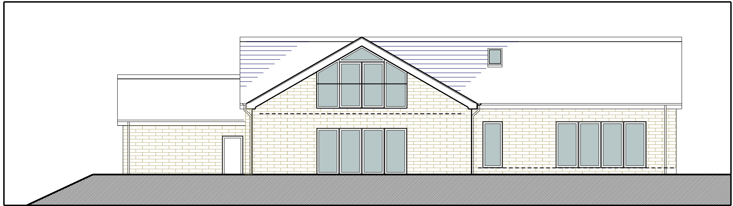
West Elevation - Proposed