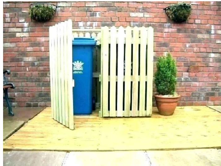
EXAMPLE BIN STORE (to be made from treated timber fencing)