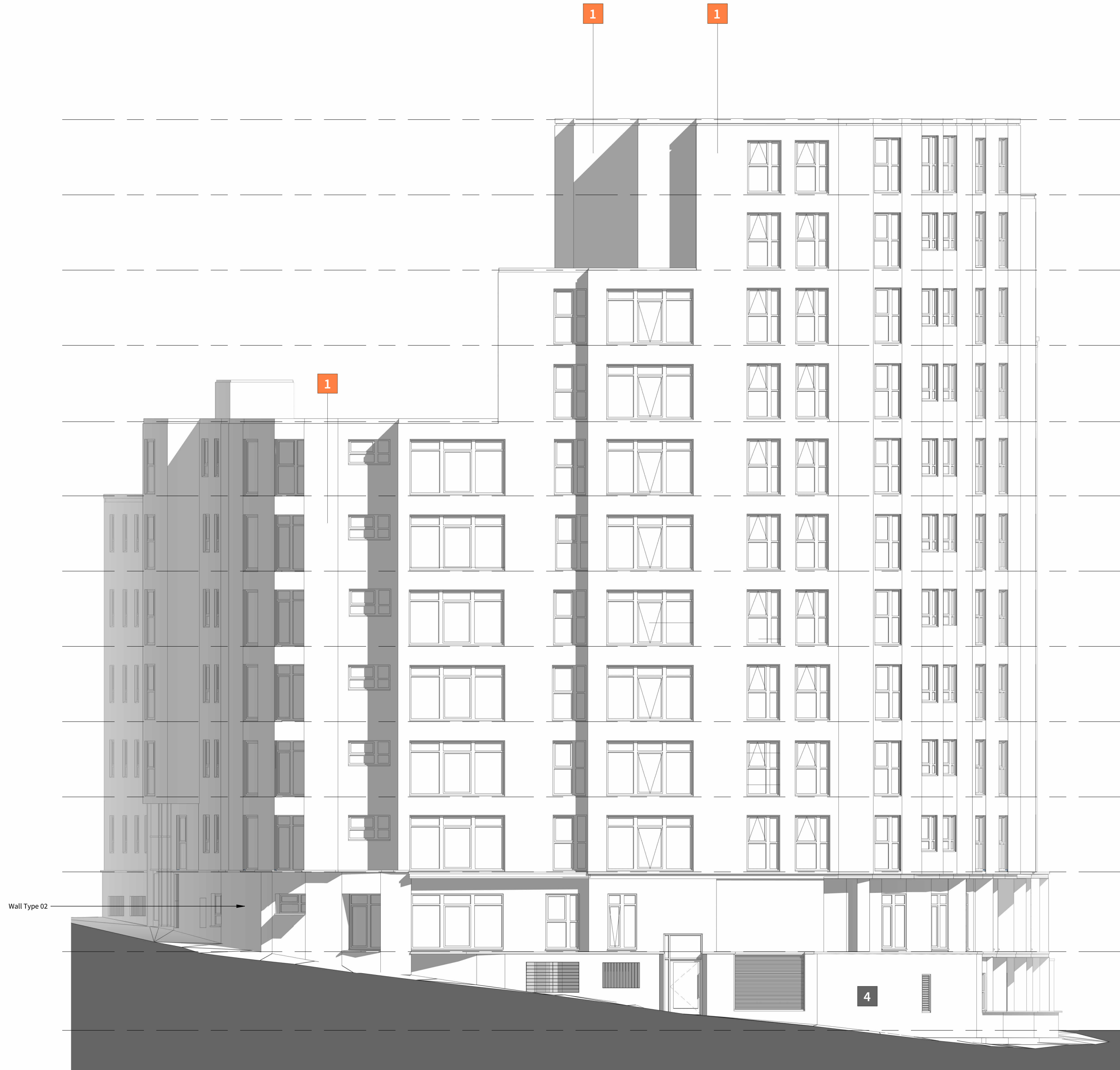
1 Proposed_Elevation - Heelis street-01 1:100