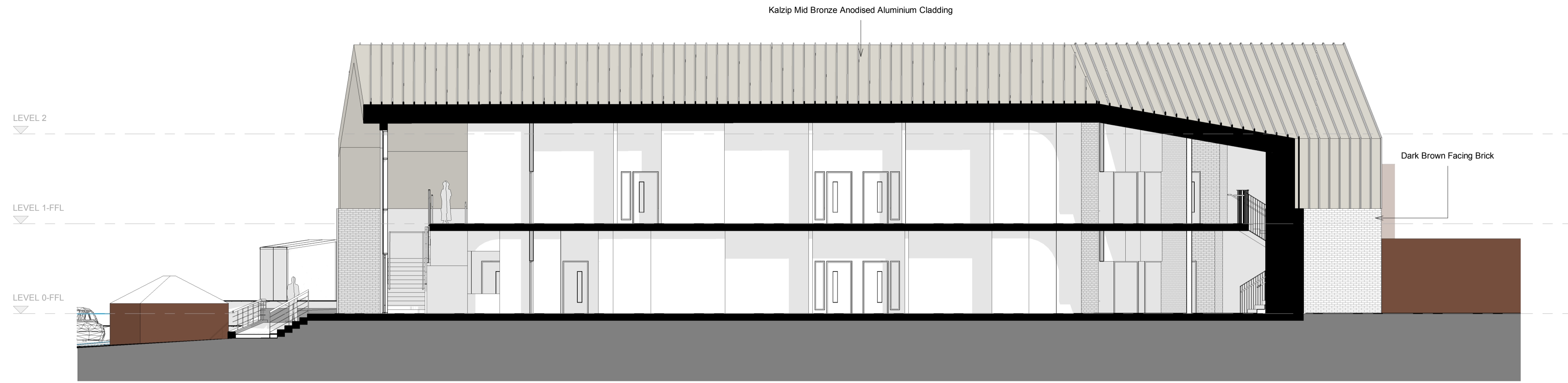
A GA Section - Section Aa 1 : 100