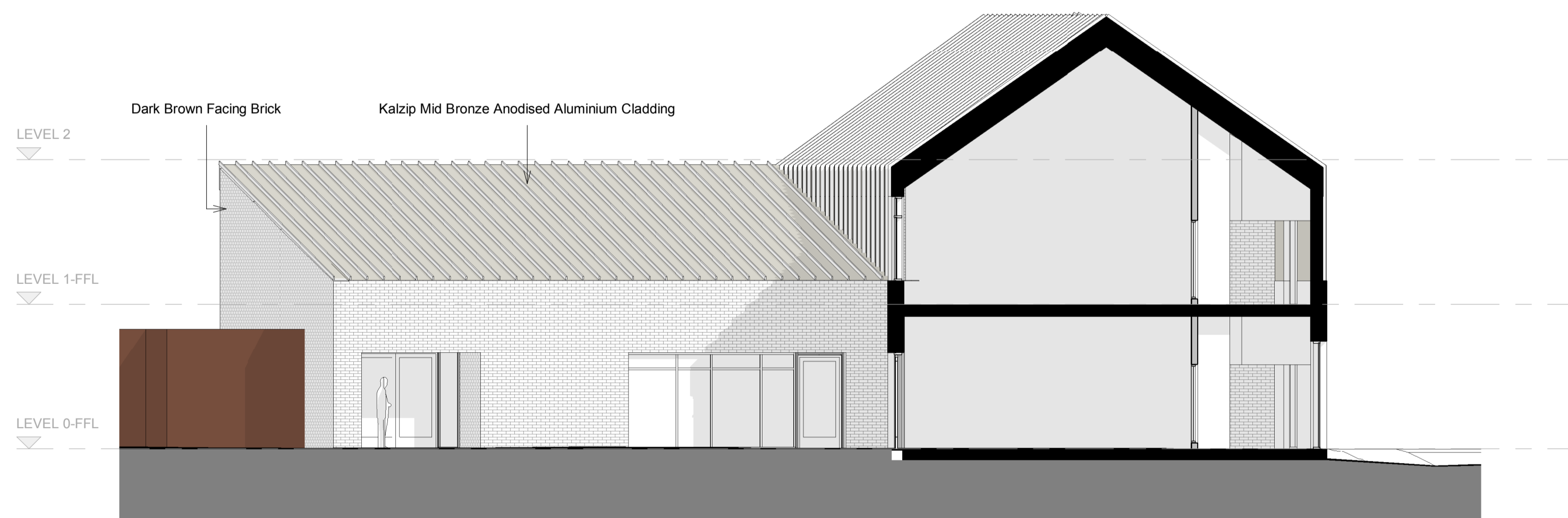
B GA Section - Section Bb 1 : 100