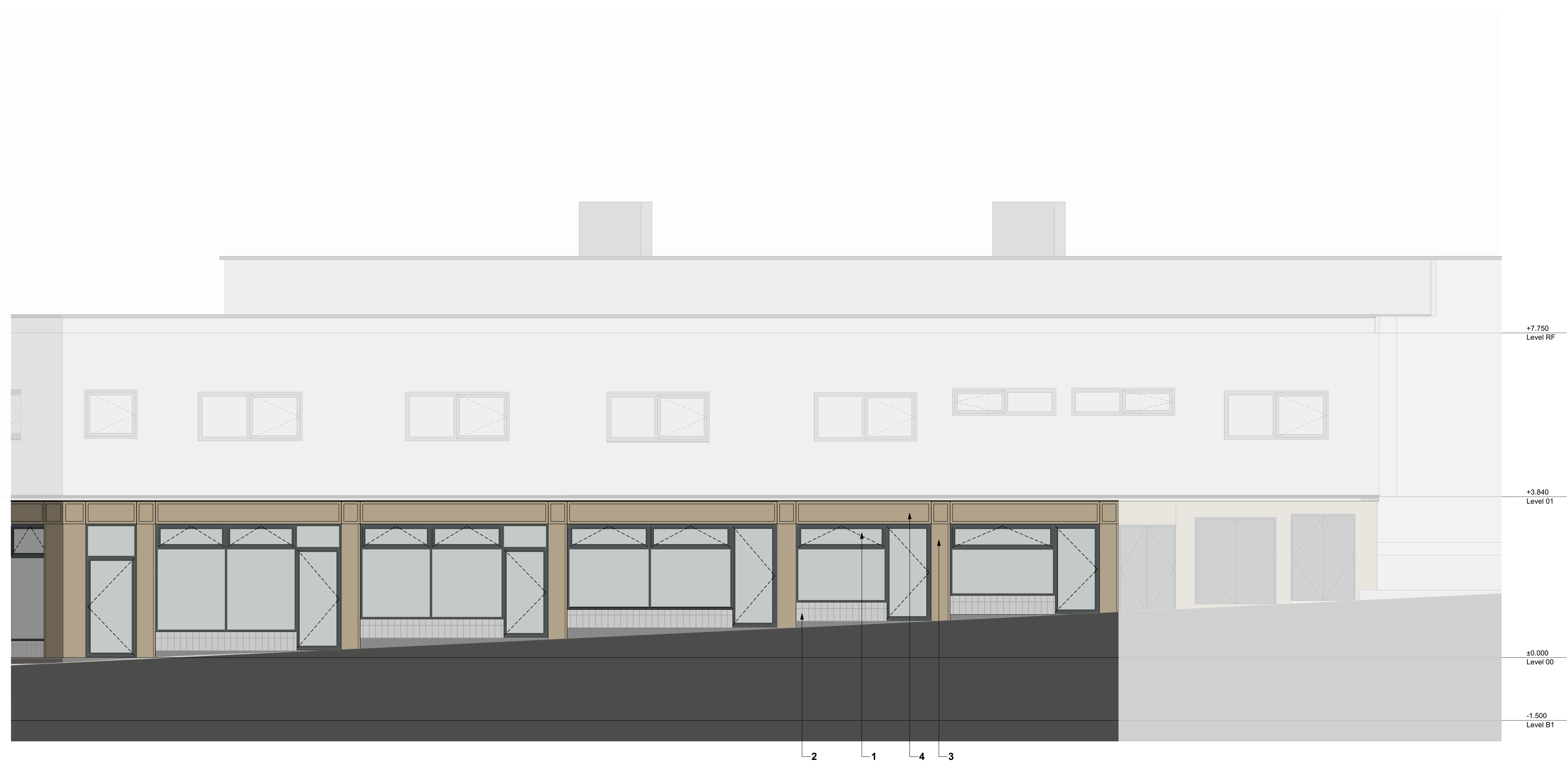
NW ELEVATION 08 1:50

This document is © Bond Bryan Architects Ltd If in doubt ASK. Drawing measurements shall not be obtained by scaling. Verify all dimensions prior to construction. Immediately report any discrepancies on this document to the Originator. This document shall be read in conjunction with associated models, specifications and related consultant documents.