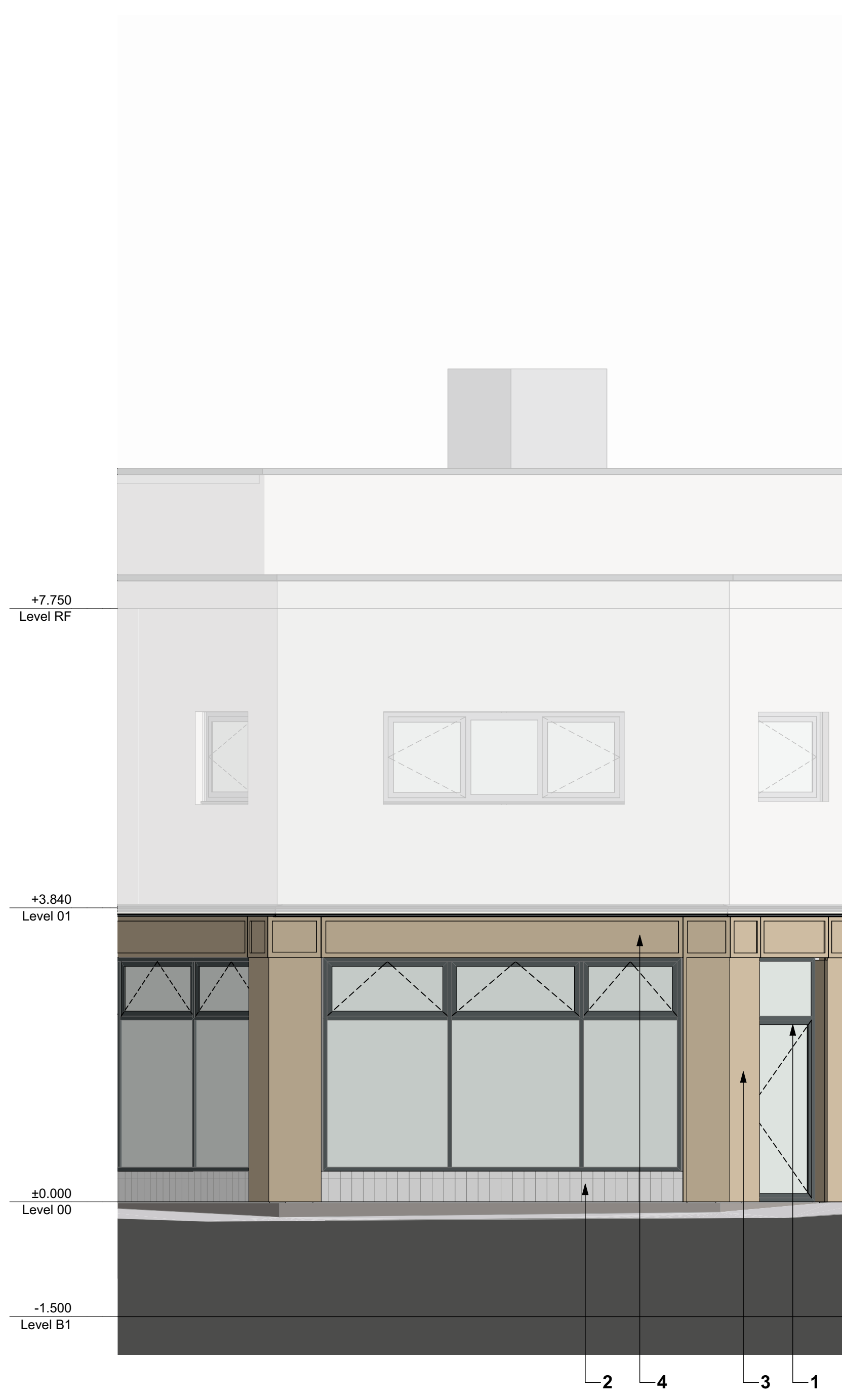
NE ELEVATION 07 1:50