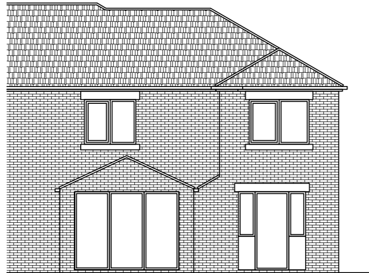
PROPOSED REAR ELEVATION SCALE 1:100 AT A3