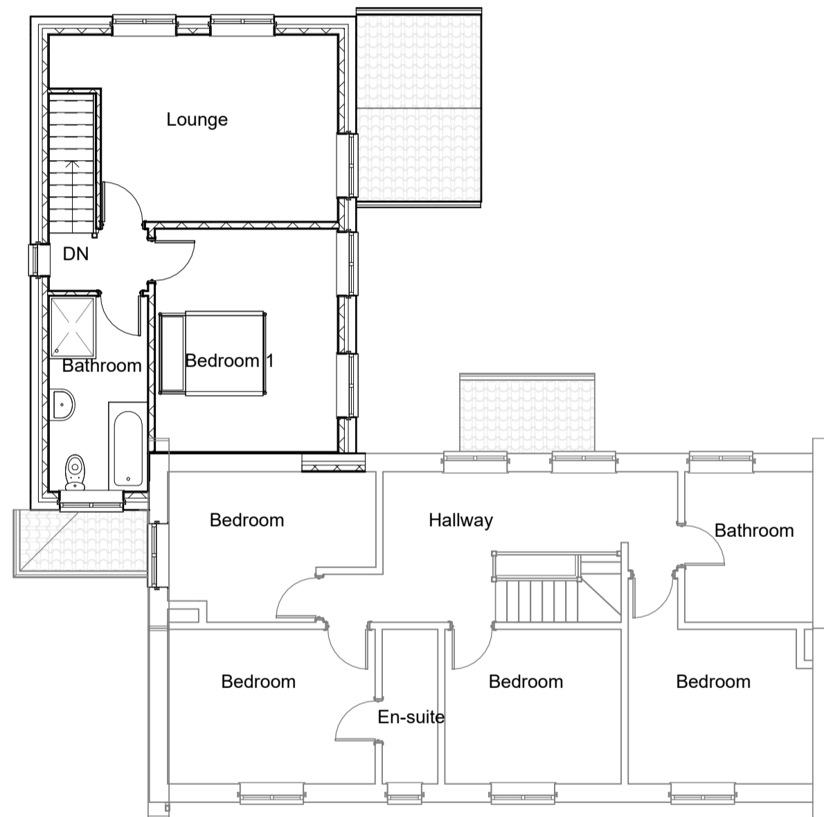
2 Proposed First Floor Level 1 : 100