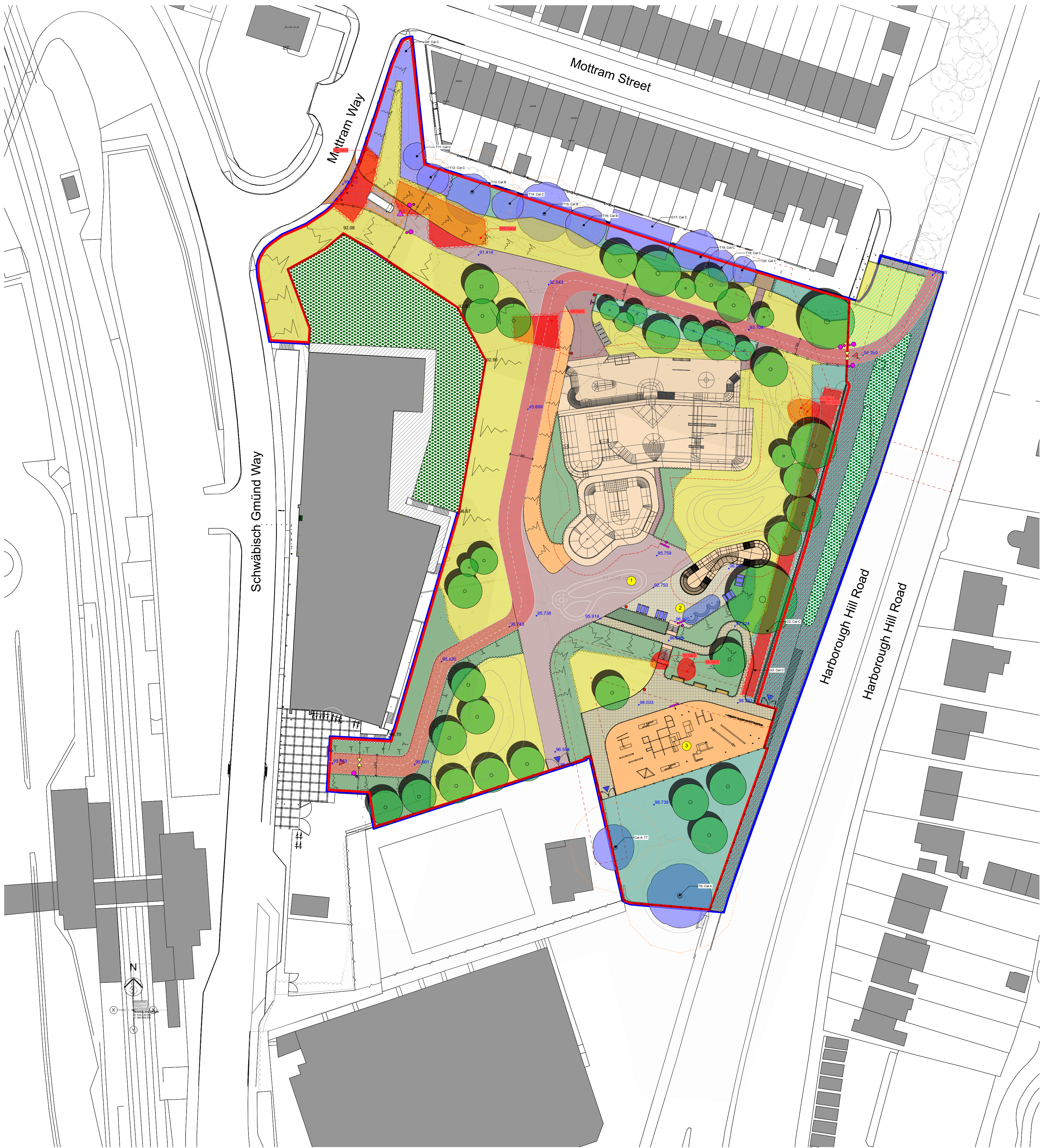
Proposed Site Plan 1:500