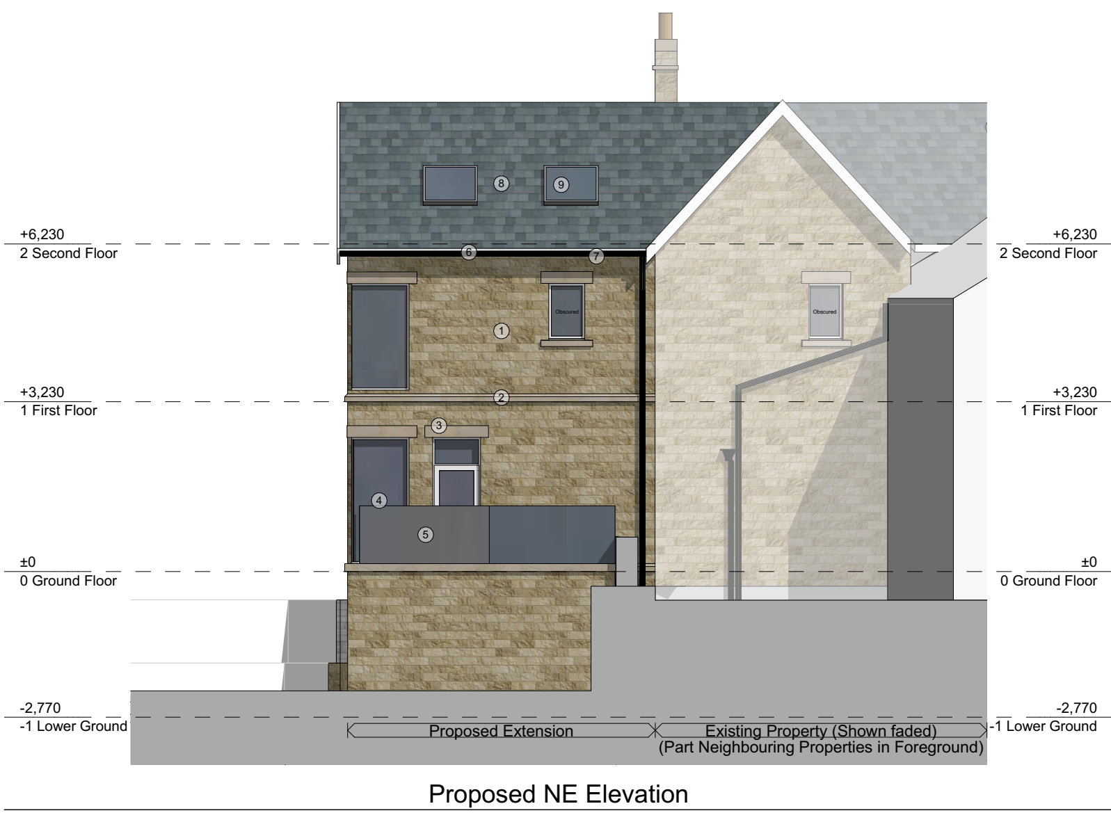
Proposed NE Elevation