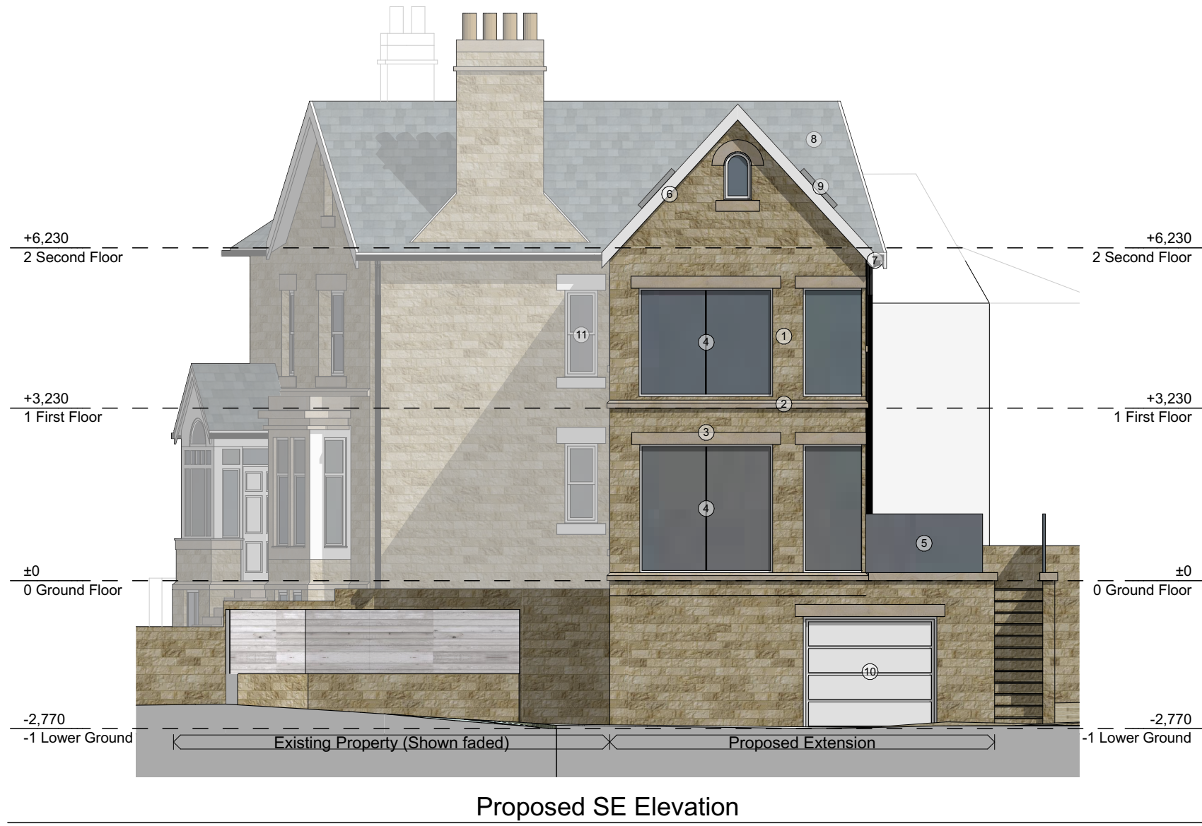
Proposed SE Elevation