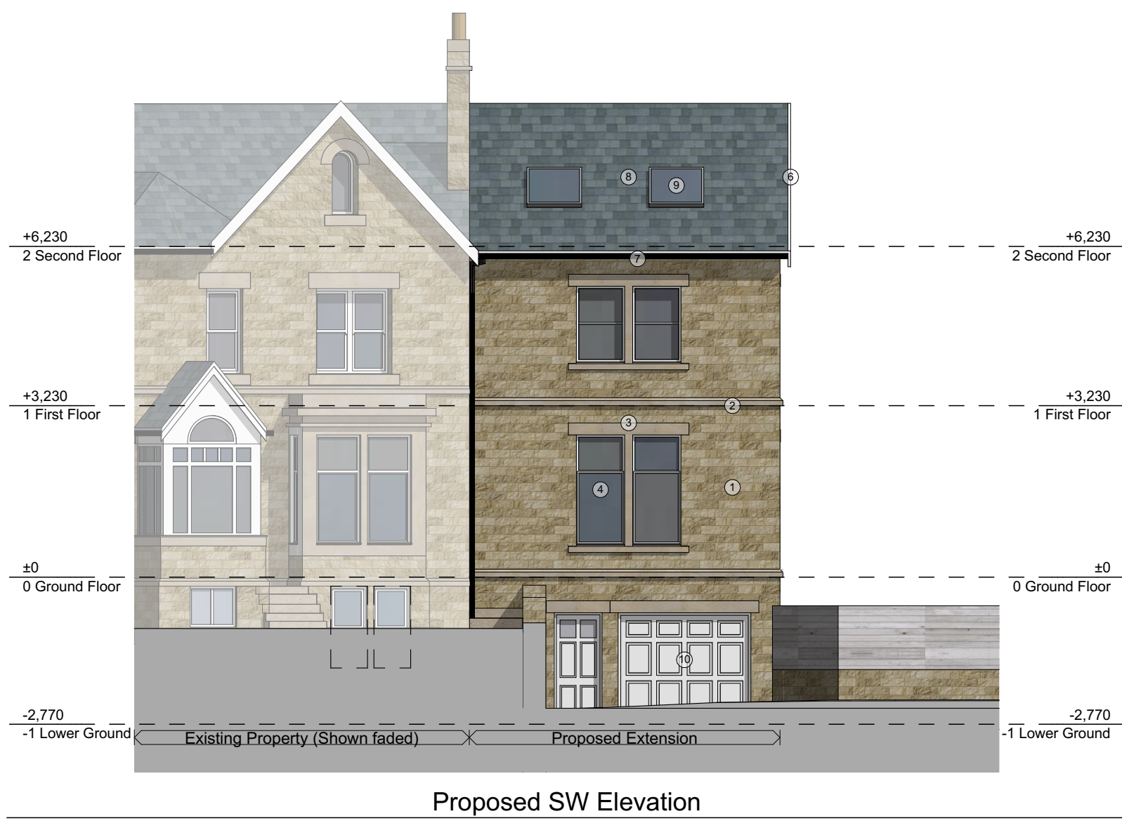
Proposed SW Elevation