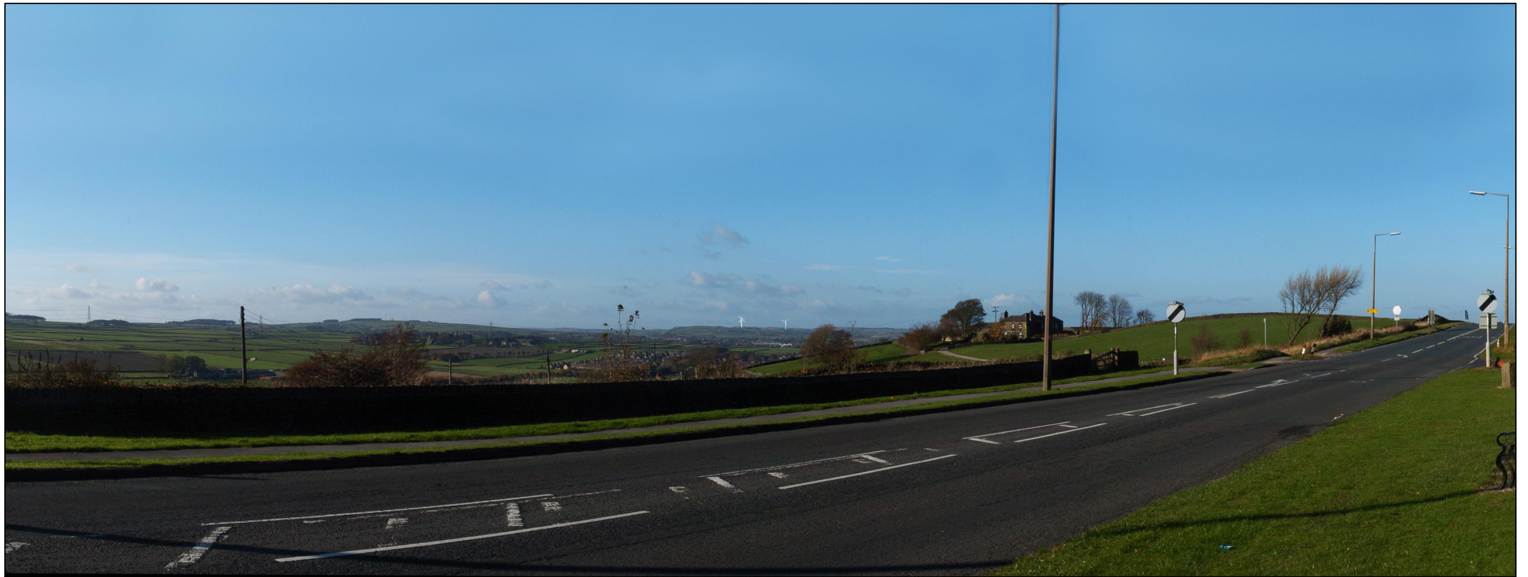
Photomontage showing proposed development from viewpoint