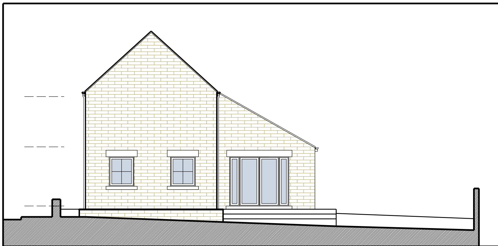
West Elevation - Proposed