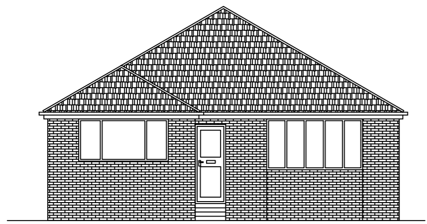
EXISTING FRONT ELEVATION SCALE 1:100 AT A3