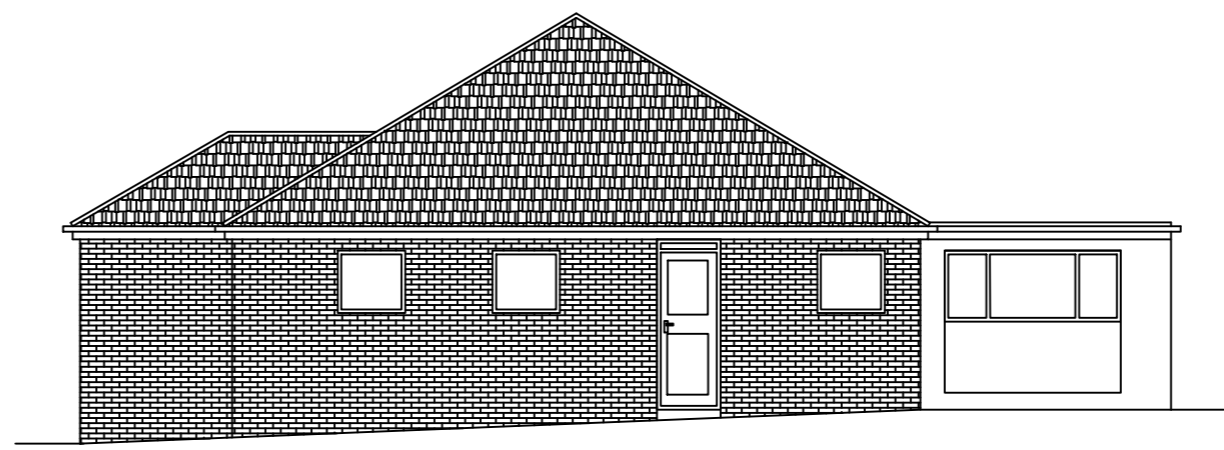
EXISTING END ELEVATION SCALE 1:100 AT A3