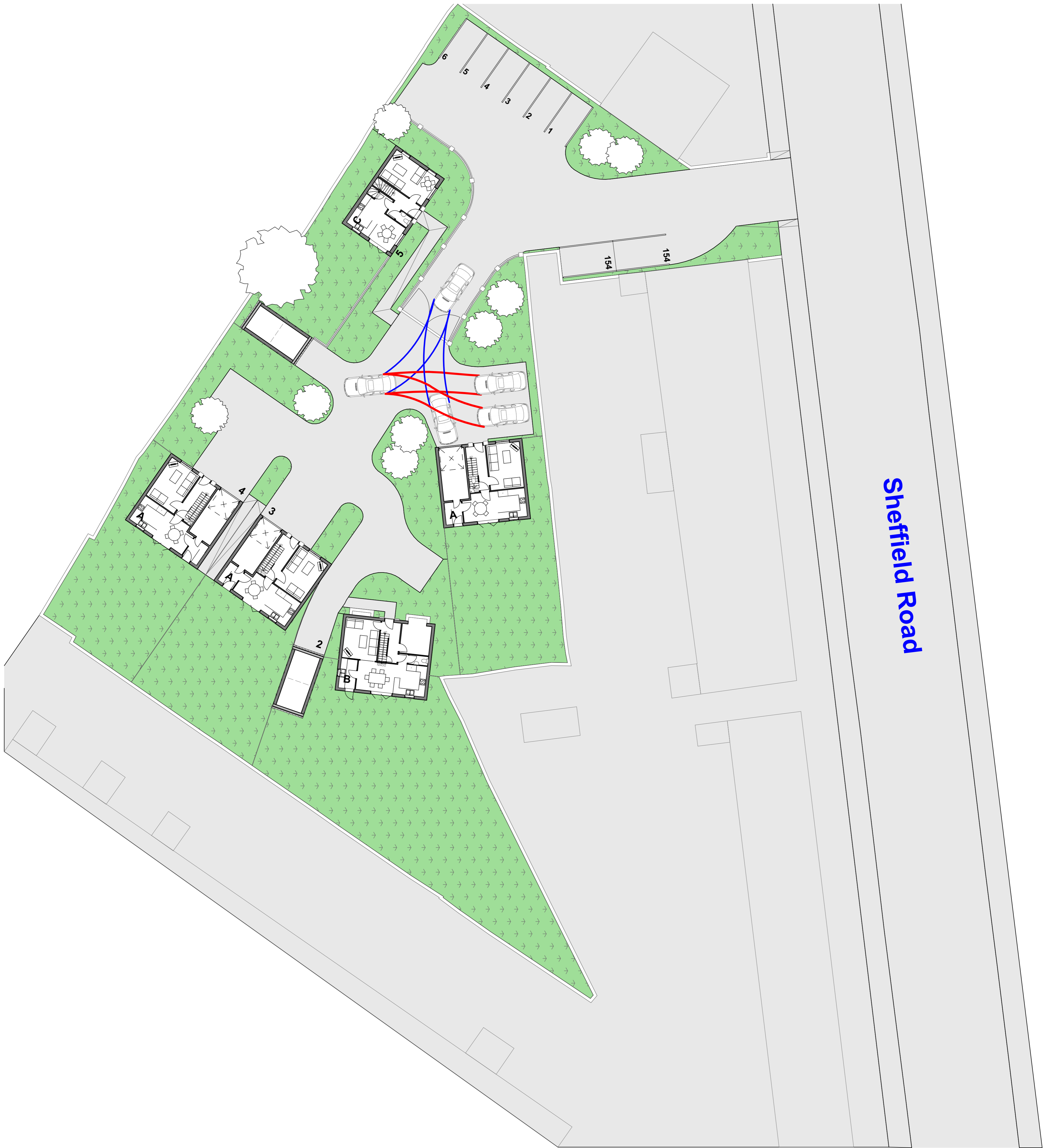
Site Plan - Car Parking 1:200