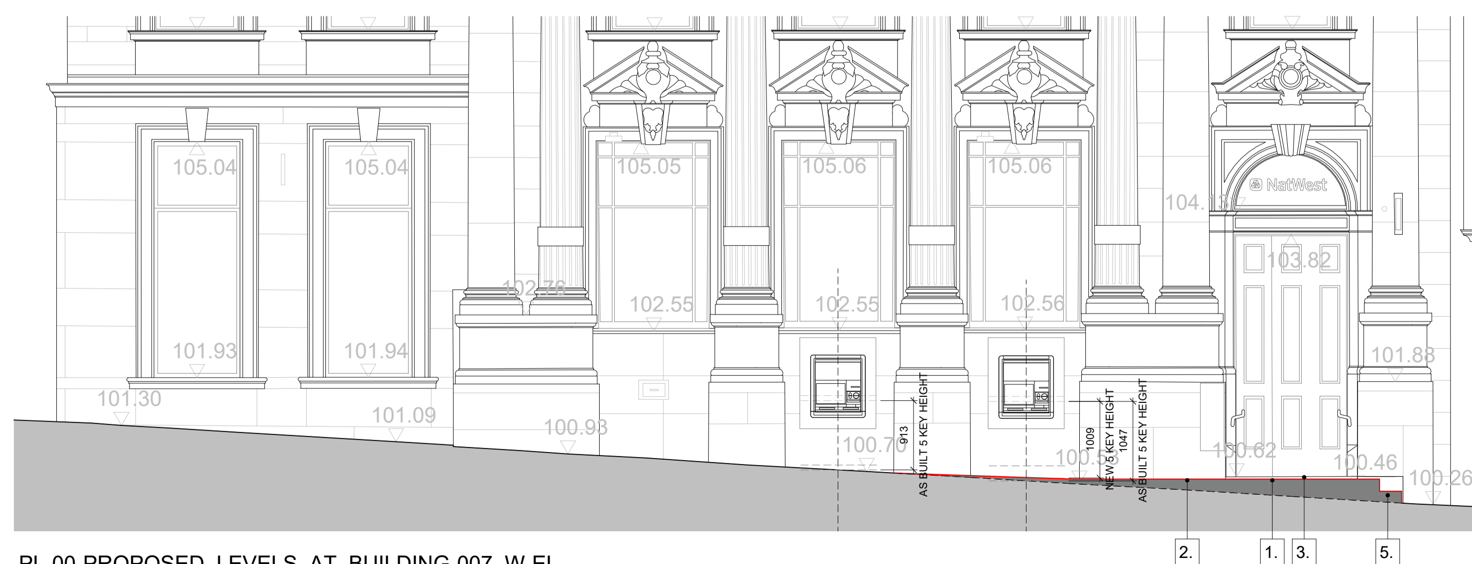
4 PL-00-PROPOSED_LEVELS_AT_BUILDING-007_W-EL 1:50