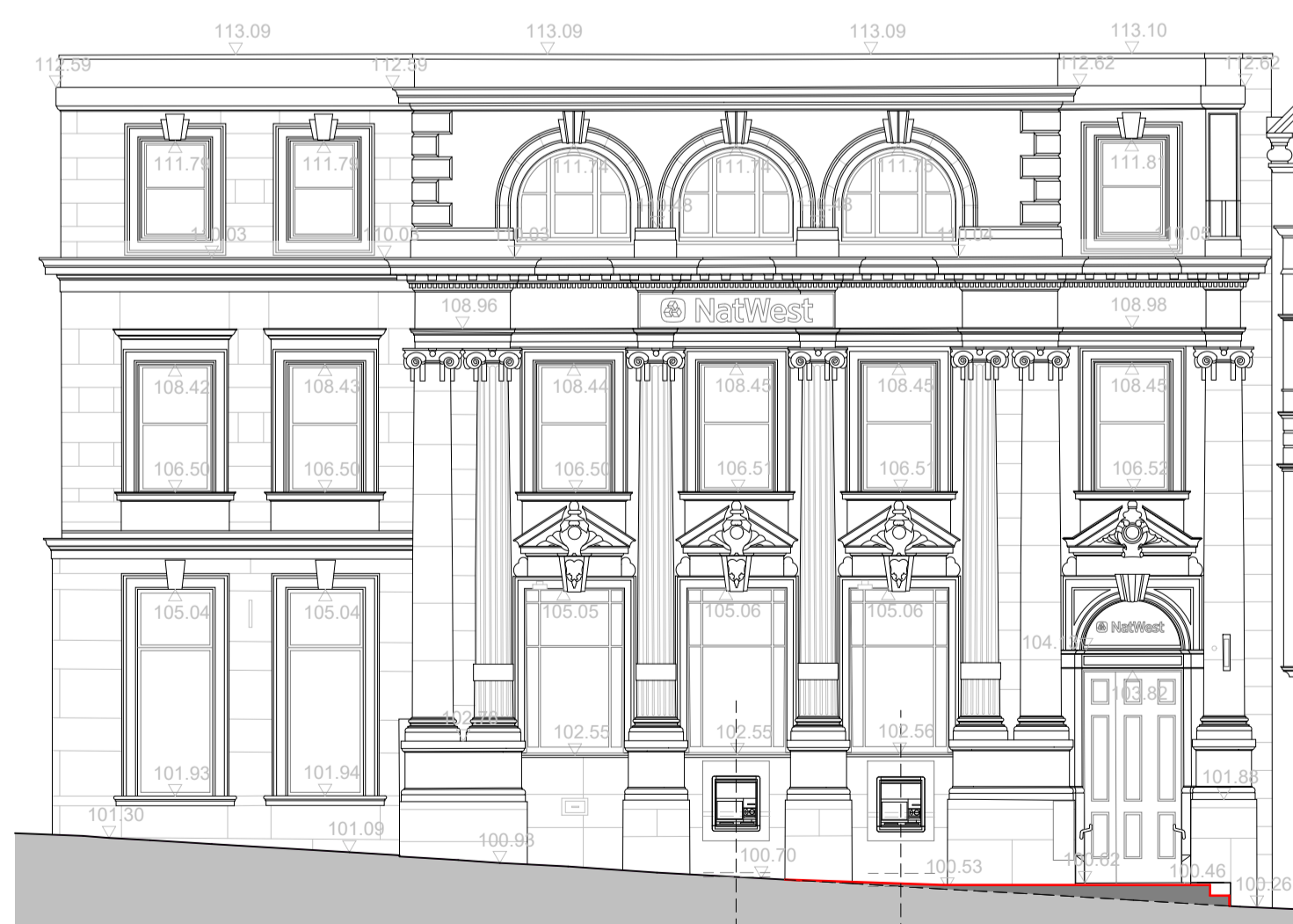
5 PL-00-PROPOSED_ELEVATION-007_W-EL 1:100