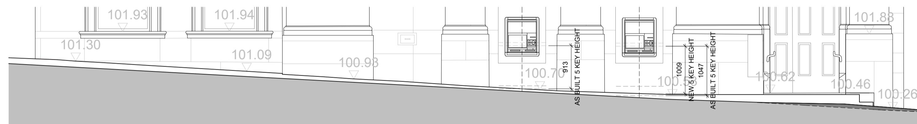
3 PL-00-PROPOSED_LEVELS_AT_PAVEMENT_CENTRE-007_W-EL 1:50